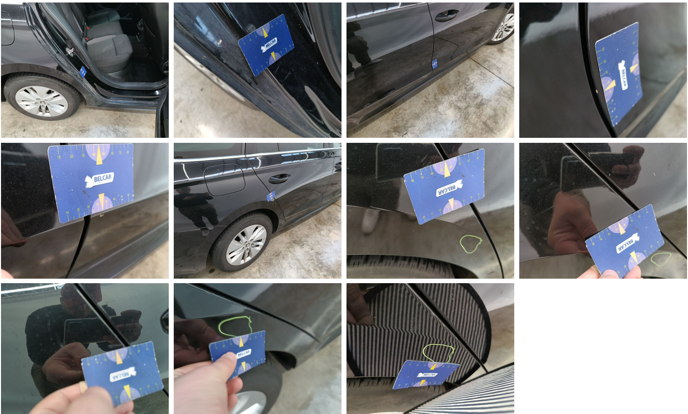
Damage within Renta-norm-scratch