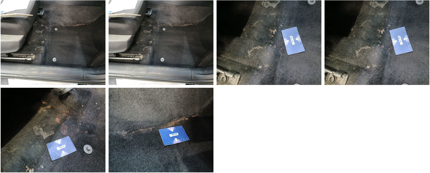
Interior // Repair 1-hole