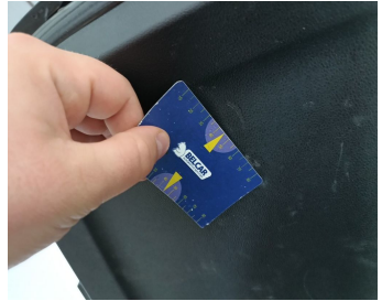
Trunk Lid Interior Coating / Complete Panel / Replace-scratch