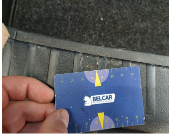
Trunk Lid Interior Coating / MDF Rear Right / Replace-scratch