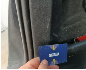
Trunk Lid Interior Coating / MDF Rear Left / Replace-scratch