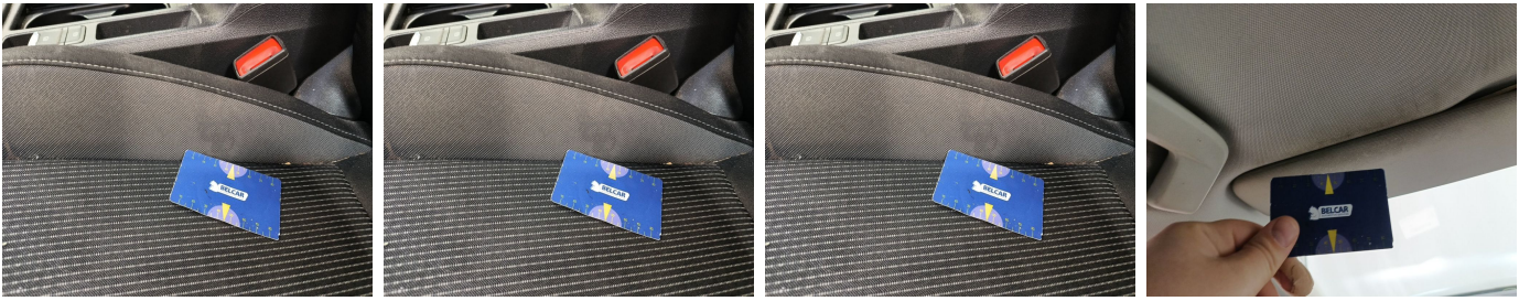
Interior Cleaning // Small-stain