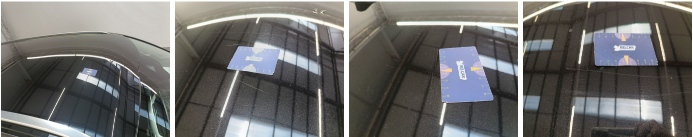
Roof // Painting-scratch