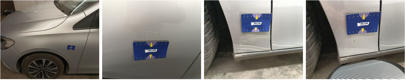
Wing Front Left // Repair & Painting-scratch + dent