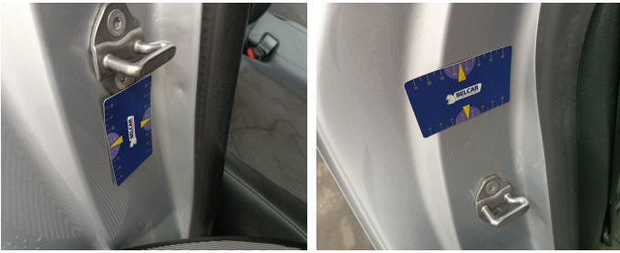
Rocker Panel Right // Smart Repair Medium-scratch + dent