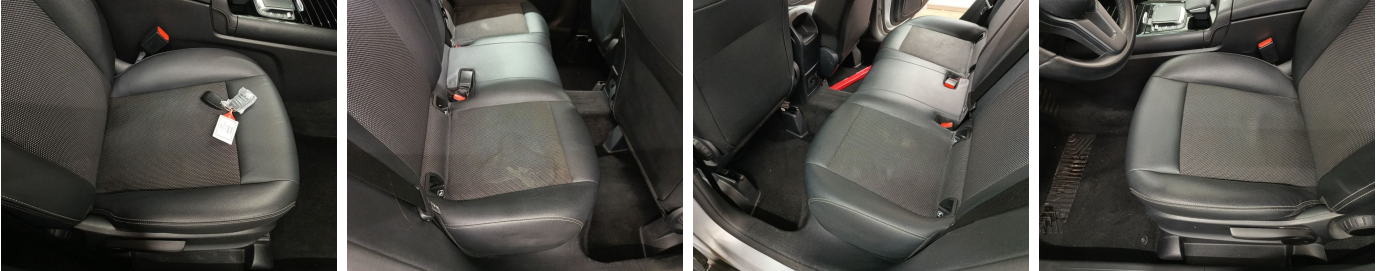
Interior Cleaning // Small-stain