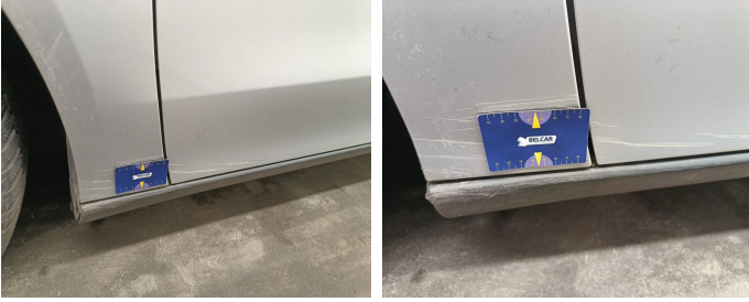
Rocker Panel Left / Cover Not Painted / Replace-scratch