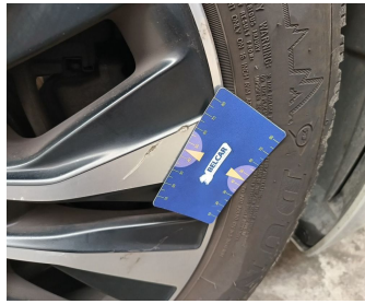
Wheel Two Tone Front Right // Repair-scratch