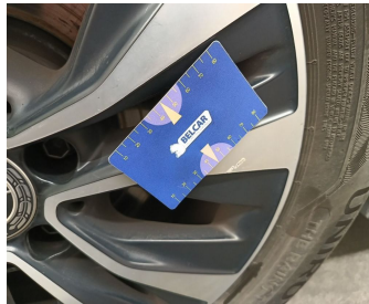
Wheel Two Tone Rear Right // Repair-scratch