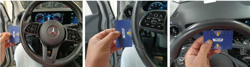
Dashboard / Steering Wheel / Replace-worn