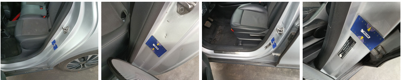
Rocker Panel Left // Smart Repair Medium-scratch + dent