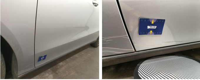
Door Front Left // Repair & Painting-scratch + dent