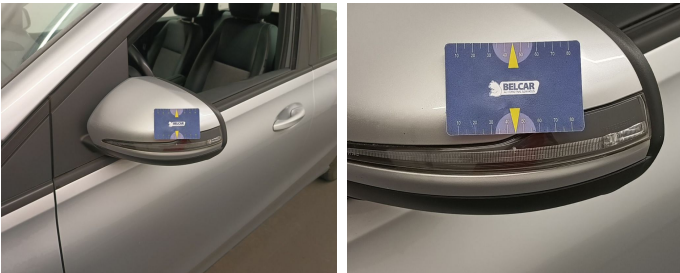
Side View Mirror Left / Direction Indicator / Replace-scratch