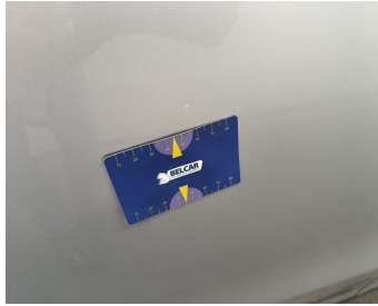
Door Rear Right // Painting-scratch