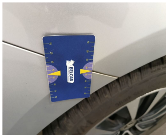
Wing Rear Right // Painting-scratch