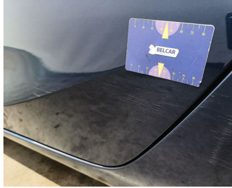
Door Rear Left // Painting-scratch