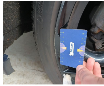
Wheel Alloy Front Left // Repair-scratch