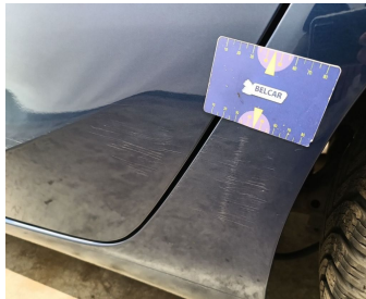
Wing Rear Left // Painting-scratch