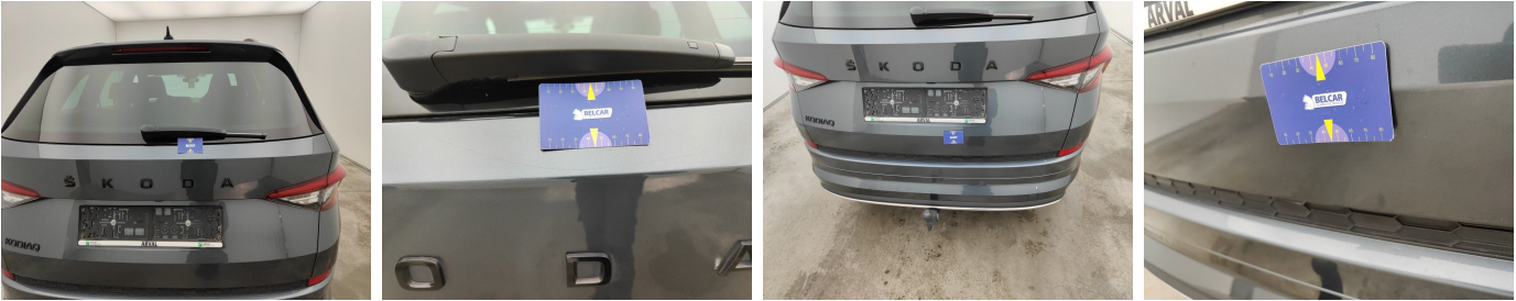
Rear Bonnet // Polish-scratch