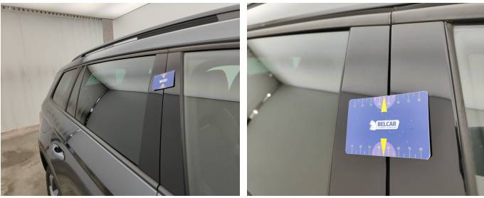
Door Rear Right / Trim / Replace-scratch