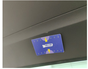
Trunk Lid Interior Coating / Complete Panel / Replace-scratch