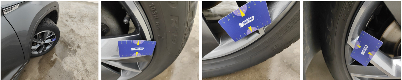
Wheel Two Tone Front Right // Repair-scratch