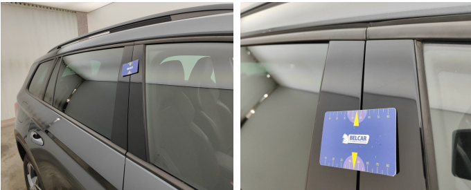
Door Front Right / Trim / Replace-scratch