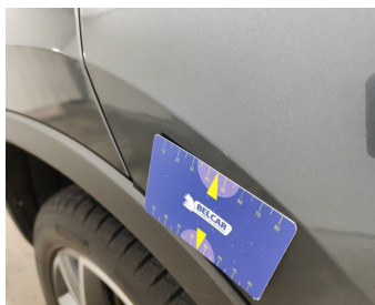
Door Rear Right // Painting-scratch + dent