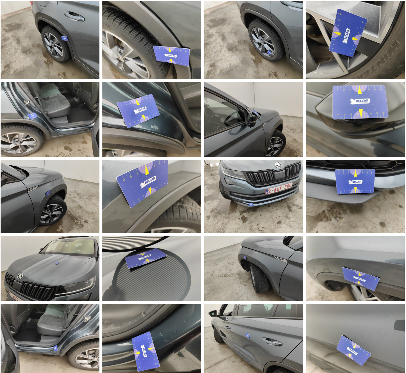
Damage within Renta-norm-scratch