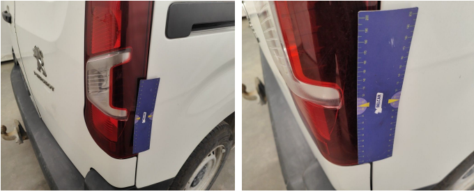
Light / Rear Right / Replace-cracked