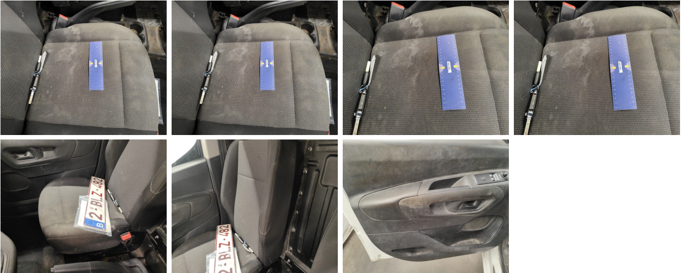
Interior Cleaning // Large-stain