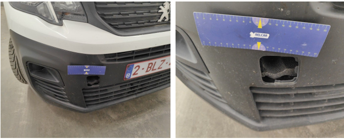
Front / Towing Cover / Replace-missing