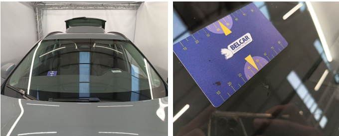
Windshield // Repair-glass damage