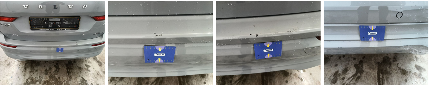
Bumper Rear // Painting-scratch