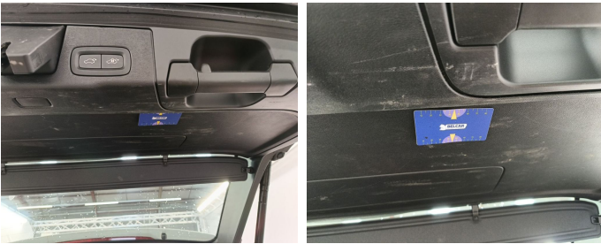
Damage within Renta-norm-scratch