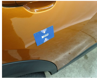
Door Rear Right // Polish-scratch