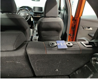
Seat Rear Right / Headrest / Replace-missing