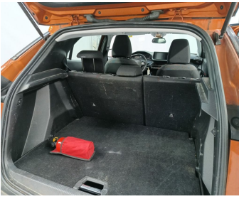
Trunk Compartment / Window Shelf / Replace-missing