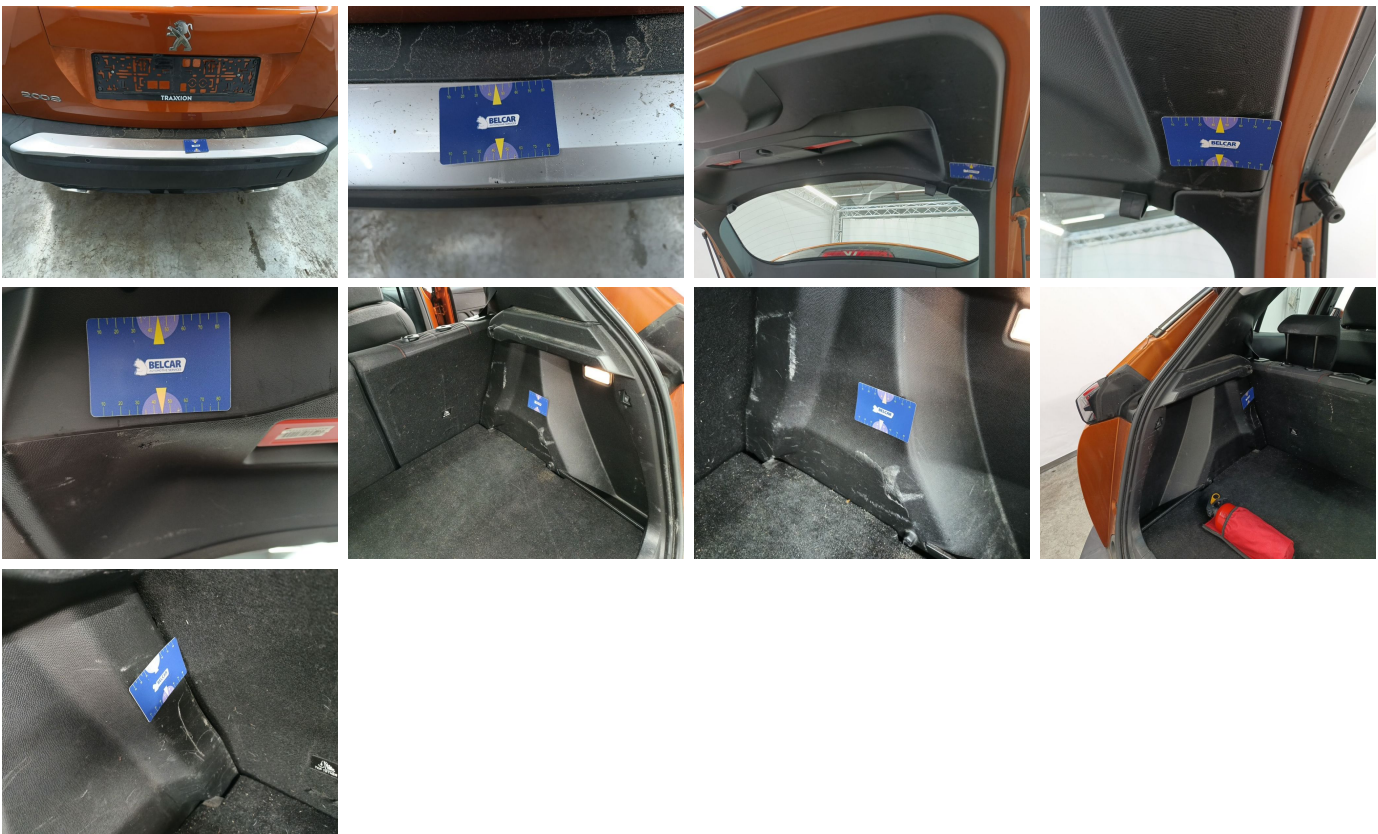
Damage within Renta-norm-scratch