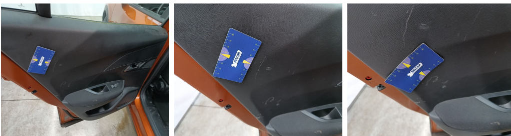
Rear Left Door Interior Coating // Repair-scratch