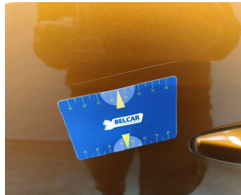
Door Rear Left // Painting-scratch