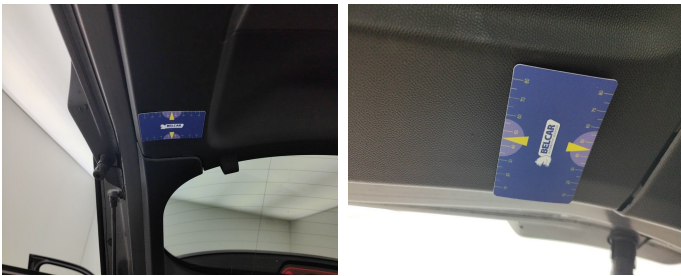
Trunk Lid Interior Coating / Complete Panel / Replace-scratch