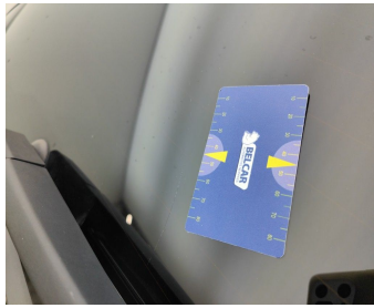
Rear Bonnet / Rear Window / Replace-scratch