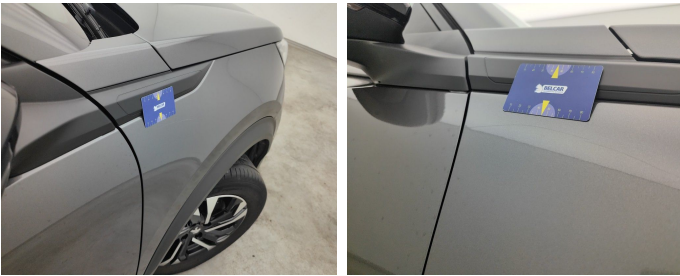
Wing Front right // Smart Repair Medium-scratch