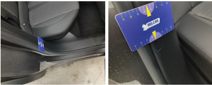
Interior / Side Cover rear Seat / Replace-scratch