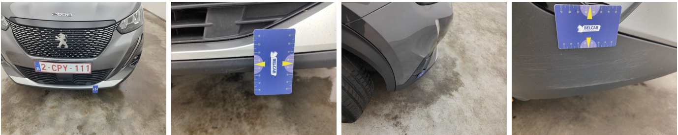
Bumper Front / Spoiler / Replace-scratch