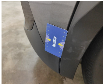
Wing Front Left / Trim / Replace-scratch