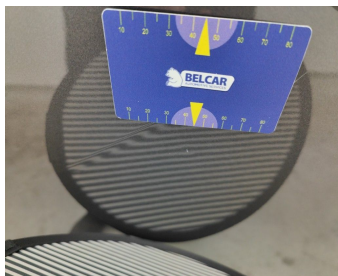
Door Rear Right // Repair & Painting-scratch + dent