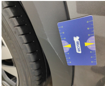
Wing Rear Left / Trim / Replace-scratch