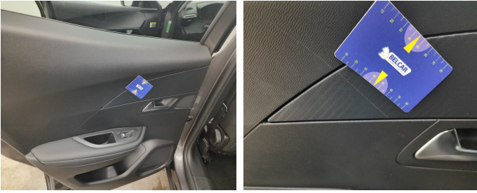
Rear Left Door Interior Coating // Repair-scratch