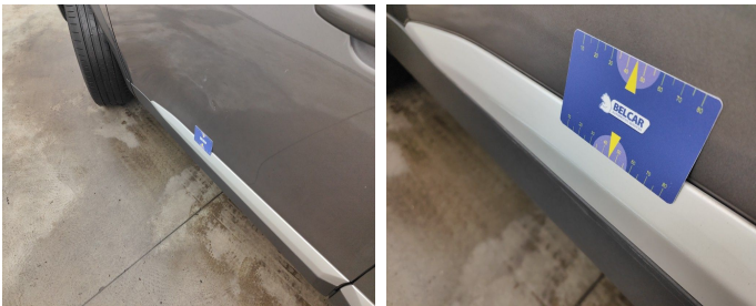
Door Front Left / Trim / Replace-scratch