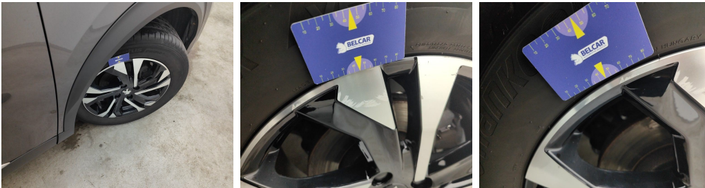
Wheel Two Tone Front Right // Repair-scratch