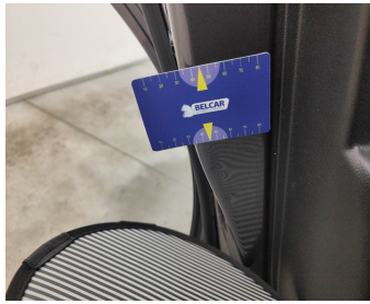
Door Rear Left // Repair & Painting-scratch + dent