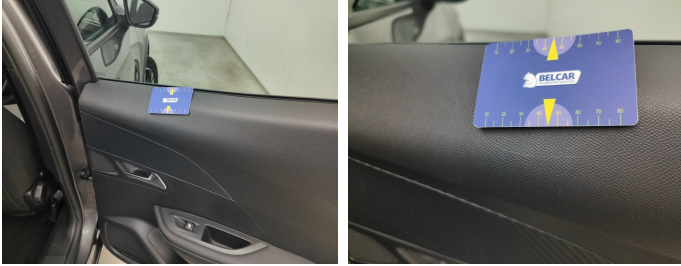
Damage within Renta-norm-