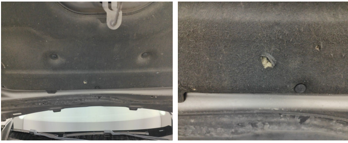
Front Bonnet / Insulation / Replace-tear