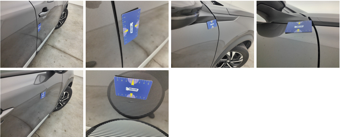
Door Front Right // Painting-scratch