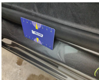
Rocker Panel Left // Smart Repair Medium-scratch + dent