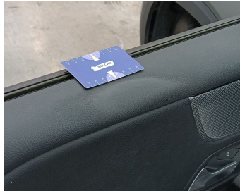
Front Left Door Interior Coating // Repair-worn