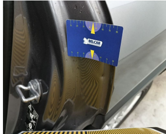
Rocker Panel Left // Smart Repair Medium-scratch + dent