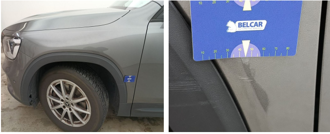
Wing Front Left // Smart Repair Medium-scratch