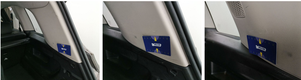
Trunk Compartment / Side Cover Right / Replace-scratch