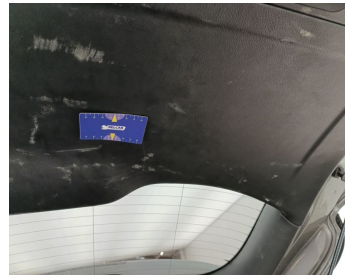
Trunk Lid Interior Coating / Complete Panel / Replace-scratch