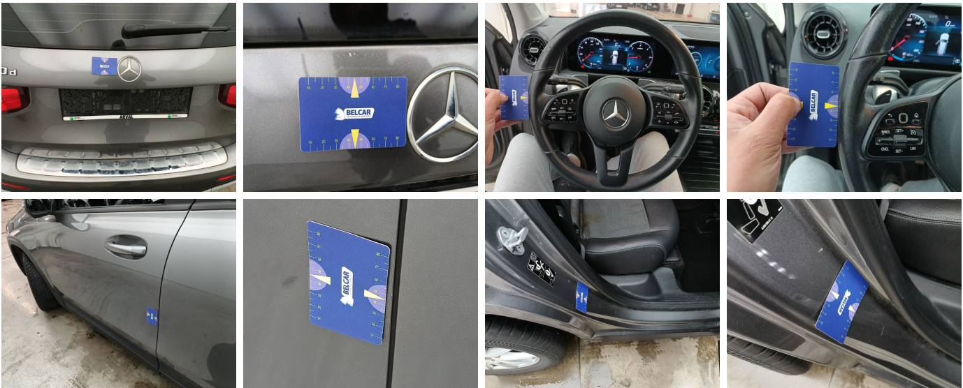
Damage within Renta-norm-