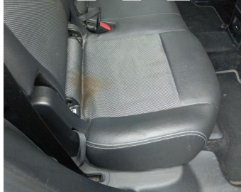
Interior Cleaning // Small-stain