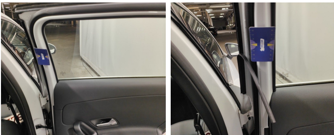
Door Rear Right / Trim / Replace-cracked