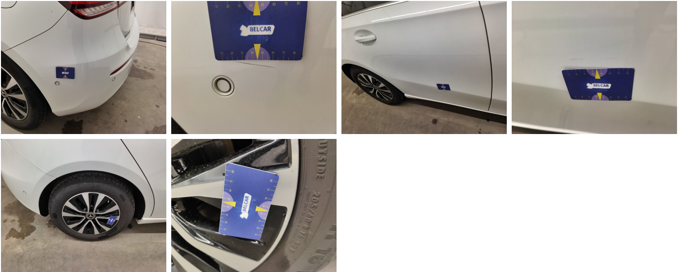
Damage within Renta-norm-scratch