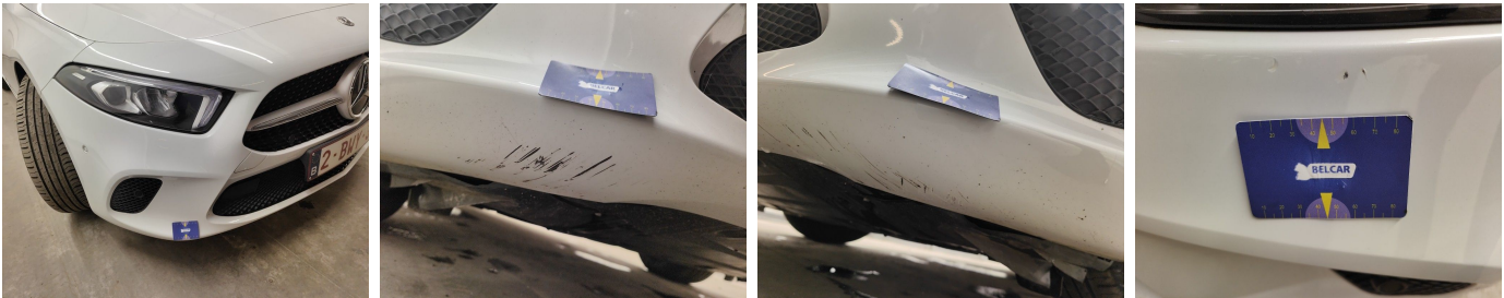
Bumper Front // Painting-scratch