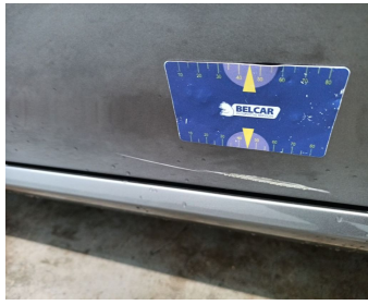
Door Front Left // Painting-scratch