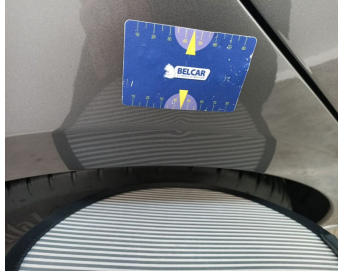
Wing Rear Right // Smart Repair Small-dent