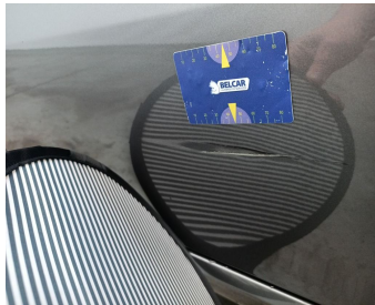
Door Rear Left // Repair & Painting-scratch + dent