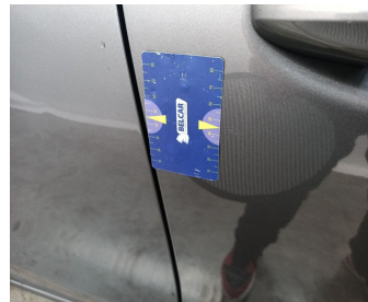
Door Front Right // Smart Repair Small-scratch + dent