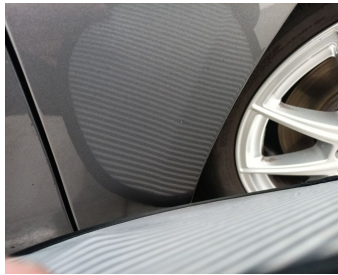
Wing Front right // Smart Repair Small-scratch + dent