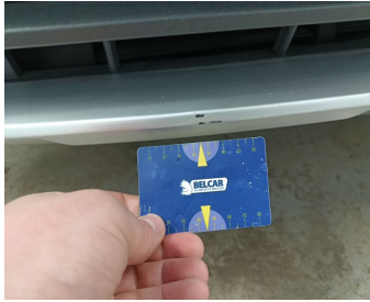
Bumper Front / Spoiler / Replace-scratch