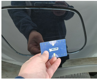
Wing Rear Right / Fuel Cover / Replace-scratch