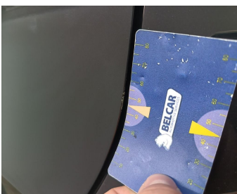
Door Rear Left // Repair & Painting-scratch + dent