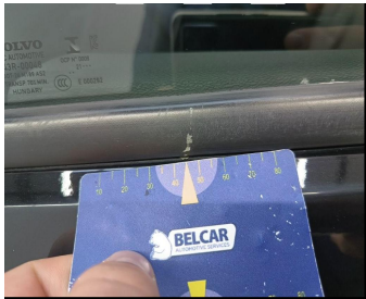
Door Rear Left / Trim / Replace-scratch