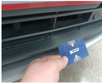
Bumper Front / Grid Central / Replace-bad position