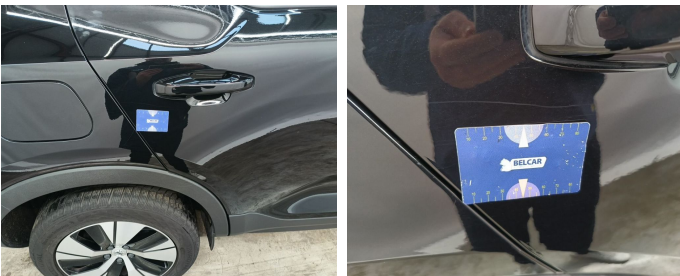
Door Rear Right // Polish-scratch