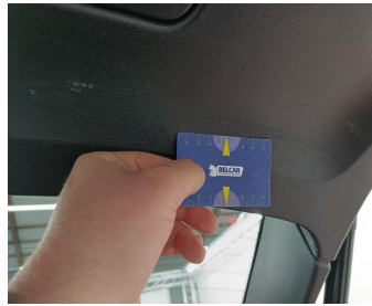
Trunk Lid Interior Coating / Complete Panel / Replace-scratch