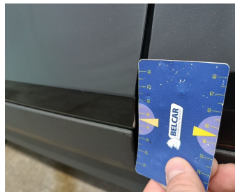
Door Front Left // Painting-scratch