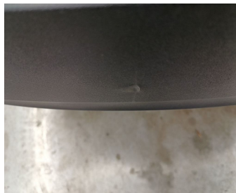
Bumper Rear / Lower Cover Not Painted / Replace-scratch + dent