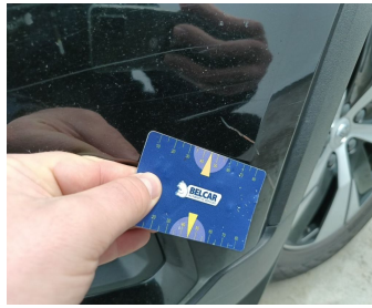
Bumper Front // Painting-scratch