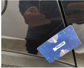
Wing Rear Right // Polish-scratch