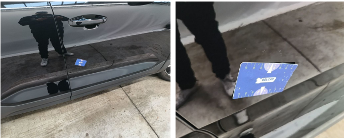
Door Front Right // Painting-scratch