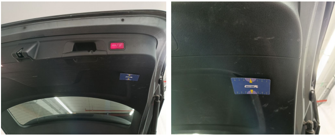
Trunk Lid Interior Coating / Complete Panel / Replace-scratch