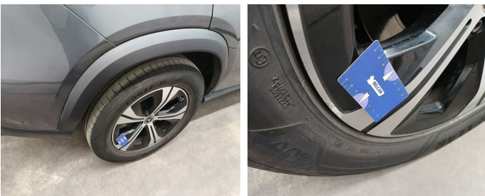
Wheel Two Tone Rear Right // Repair-scratch