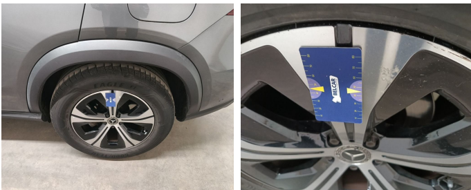
Wheel Two Tone Rear Left // Repair-Chemical reaction