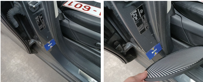
Rocker Panel Right // Smart Repair Medium-scratch + dent