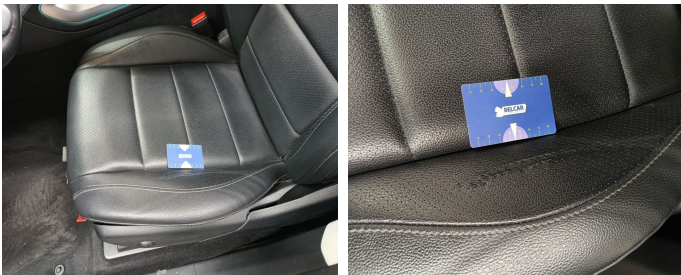
Seat Front Left / Bottom Coating / Replace-worn