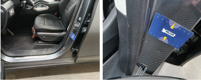
Rocker Panel Left // Smart Repair Medium-scratch + dent