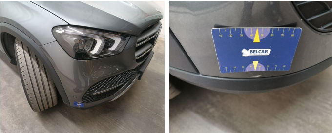
Bumper Front // Polish-scratch