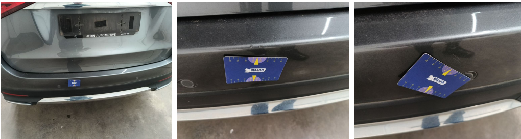
Bumper Rear // Painting-scratch