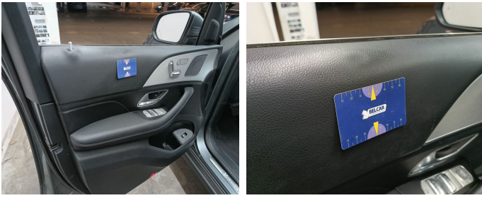
Front Left Door Interior Coating // Replace Completely-worn