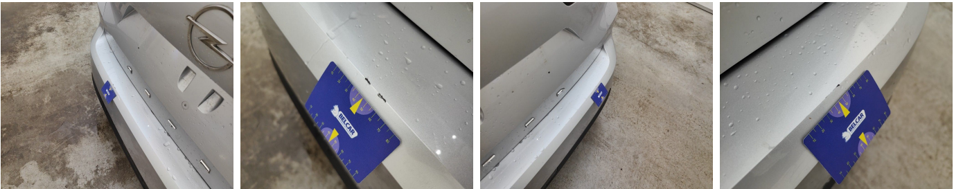
Bumper Rear // Painting-scratch