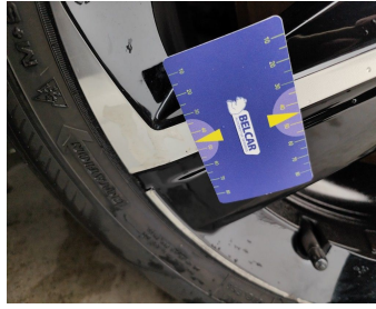
Wheel Two Tone Front Right // Repair-scratch