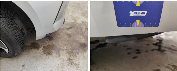
Bumper Front // Smart Repair Large-scratch