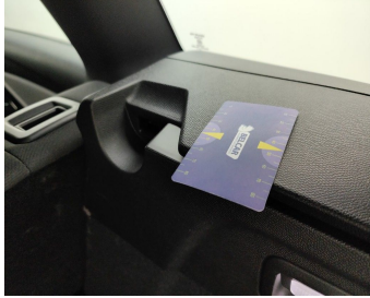
Trunk Compartment / Boot Cover / Replace-missing