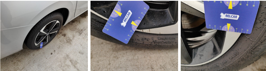
Wheel Two Tone Rear Right // Repair-scratch