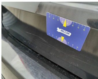
Rear Bonnet // Polish-scratch