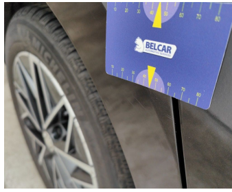
Wing Rear Right // Polish-scratch