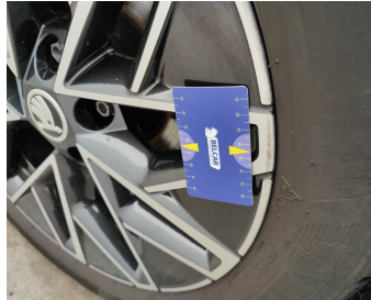
Wheel Two Tone Rear Left // Repair-Chemical reaction