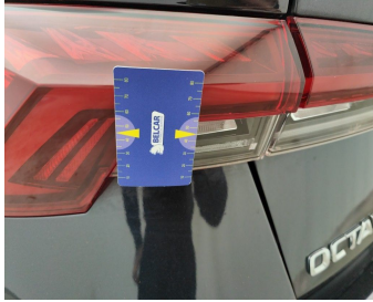
Light / Rear left / Replace-cracked