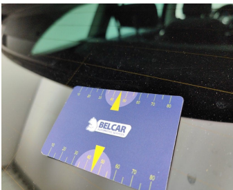
Rear Bonnet / Rear Window / Replace-scratch