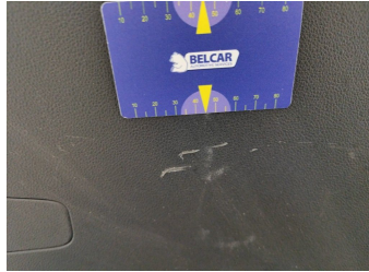
Damage within Renta-norm-