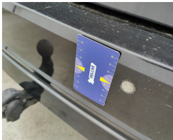
Back Side / Park Assist Sensor / Replace-Chipped paint