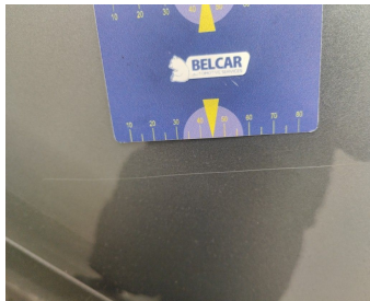
Wing Rear Left // Polish-scratch