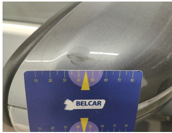
Damage within Renta-norm-