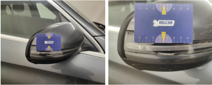
Side View Mirror Right / Direction Indicator / Replace-cracked