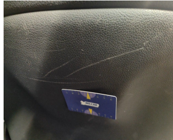
Seat Front Right // Repair-scratch