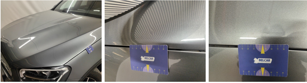
Front Bonnet // Painting-scratch + dent