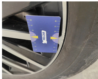
Wheel Two Tone Front Right // Repair-scratch