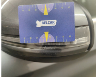
Side View Mirror Left / Direction Indicator / Replace-scratch