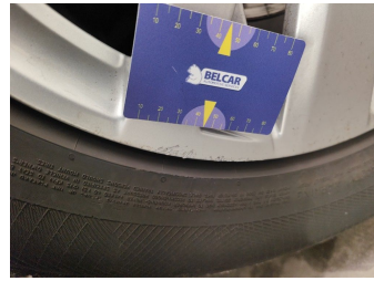
Damage within Renta-norm-