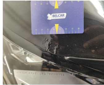
Front Bonnet // Painting-rust