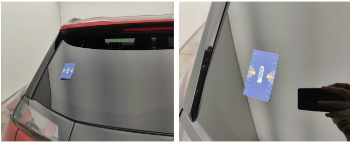
Rear Bonnet / Rear Window / Replace-scratch