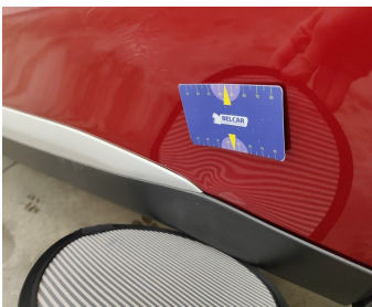
Door Front Right // Repair & Painting-scratch + dent