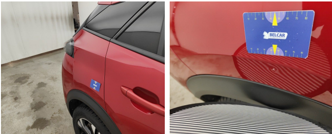
Wing Rear Right // Repair & Painting-scratch + dent