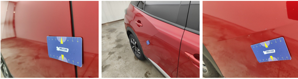
Damage within Renta-norm-