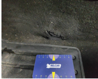
Interior / Floor Covering / Replace-tear