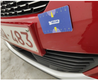
Bumper Front // Repair & Painting-scratch + dent