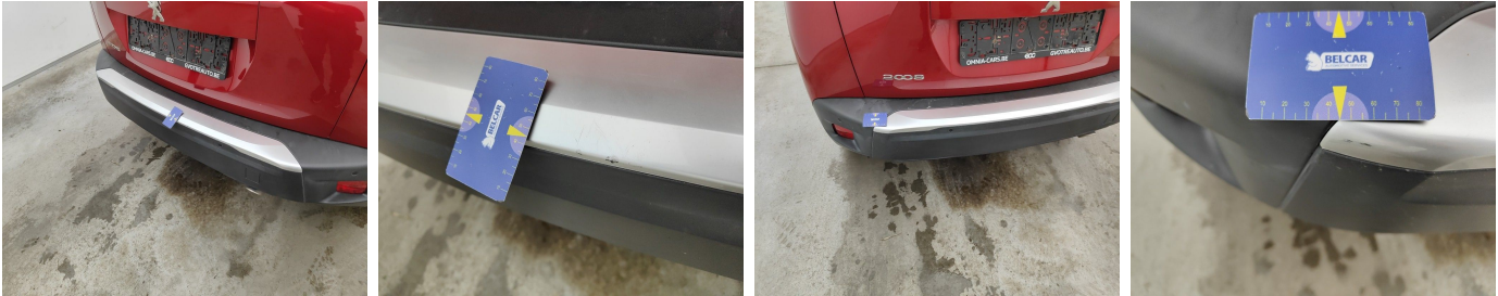
Bumper Rear / Trim Center / Replace-scratch + dent