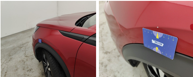
Wing Front Left // Painting-scratch