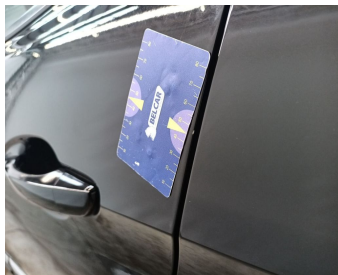
Door Rear Left // Painting-scratch