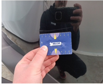
Bumper Rear // Polish-scratch