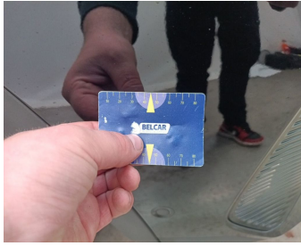
Bumper Front // Painting-scratch