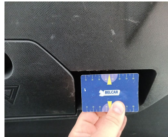
Trunk Lid Interior Coating / Complete Panel / Replace-scratch