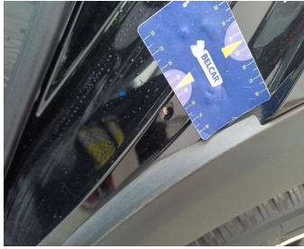
Rocker Panel Left // Smart Repair Medium-scratch + dent