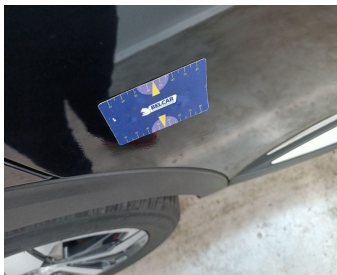
Door Rear Right // Repair & Painting-bad repair