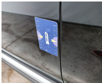
Door Front Left // Smart Repair Small-scratch