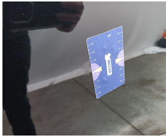
Door Front Right // Painting-scratch