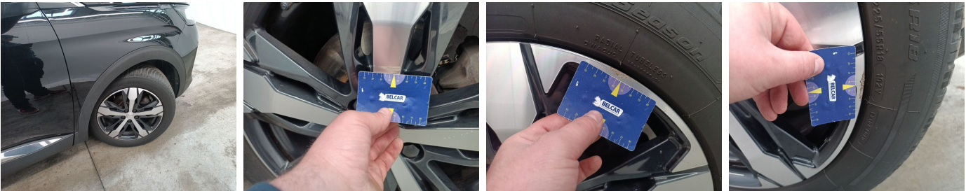
Wheel Two Tone Front Right // Repair-scratch