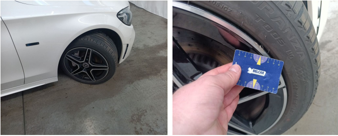
Damage within Renta-norm-