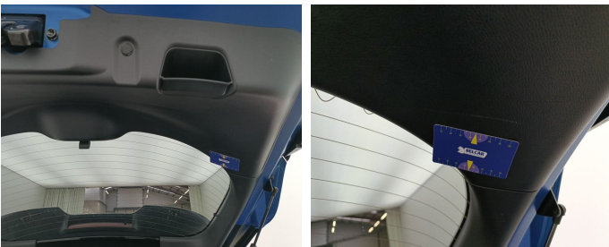
Trunk Lid Interior Coating / Complete Panel / Replace-scratch