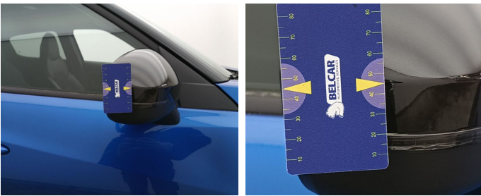
Side View Mirror Right // Painting-scratch