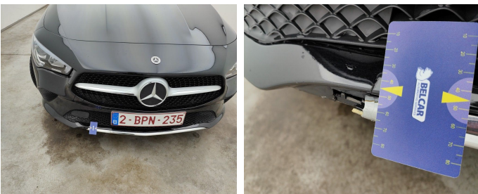
Bumper Front // Replace & Painting-cracked