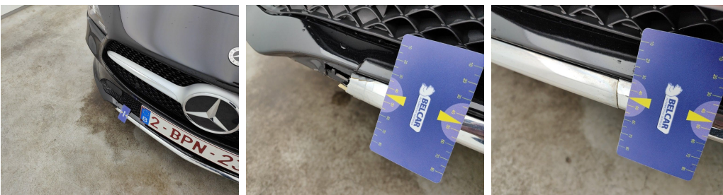
Bumper Front / Spoiler / Replace-cracked