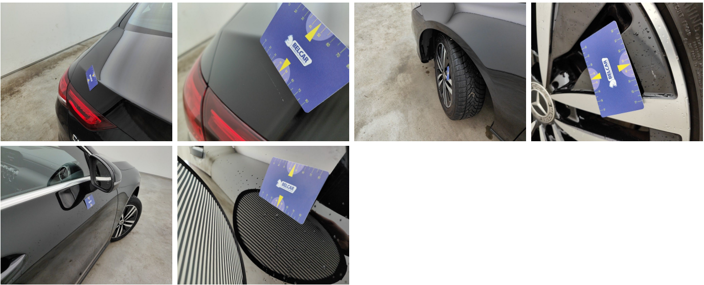
Damage within Renta-norm-