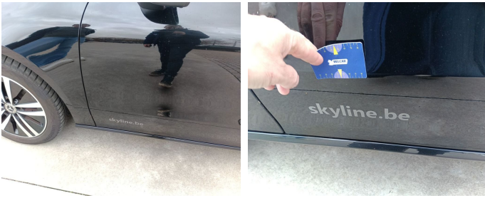
Lettering Removal 15min-Remainder stickers