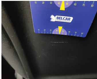
Seat Front Left // Repair-scratch