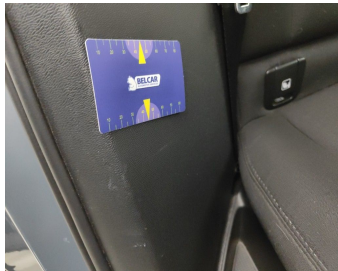
Interior / Side Cover rear Seat / Replace-scratch