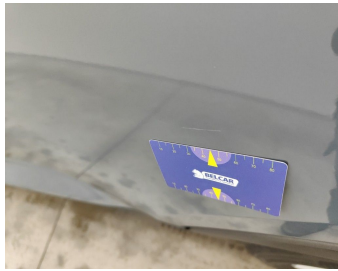
Damage within Renta-norm-