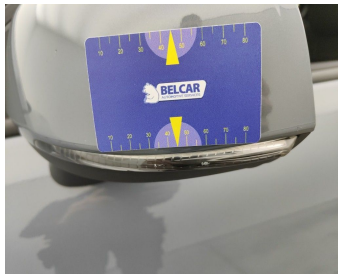
Side View Mirror Left / Direction Indicator / Replace-scratch