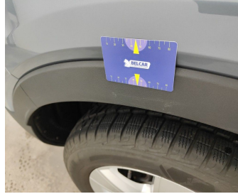
Wing Rear Right / Trim / Replace-scratch