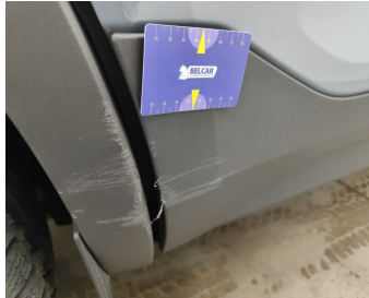
Door Rear Right / Trim / Replace-scratch