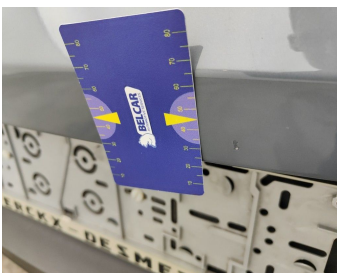
Rear Bonnet // Repair & Painting-scratch + dent