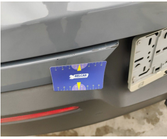
Bumper Rear // Painting-scratch