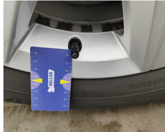
Wheel Alloy Rear Left // Repair-scratch