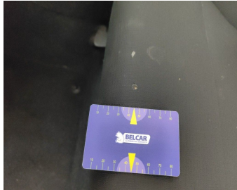
Seat Front Left // Repair-Incinerated