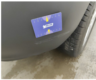
Bumper Rear / Lower Cover Not Painted / Replace-cracked