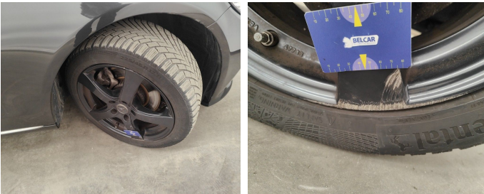
Wheel Alloy Front Right // Repair-scratch