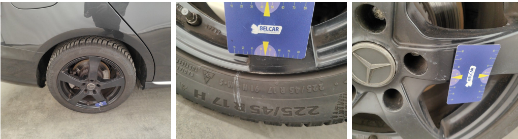
Wheel Alloy Rear Right // Repair-