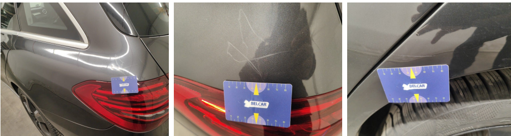
Wing Rear Left // Polish-scratch