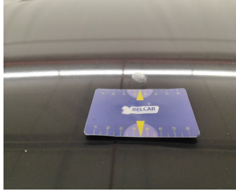
Roof // Polish-Chemical reaction