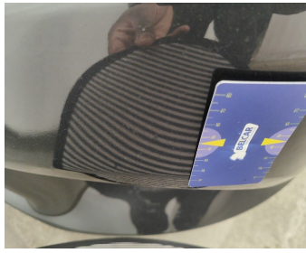
Bumper Front // Painting-bad repair