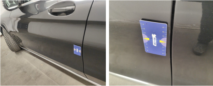
Door Front Left // Smart Repair Medium-scratch