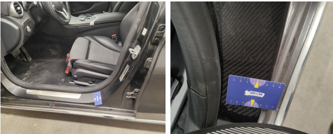
Rocker Panel Left // Smart Repair Medium-dent