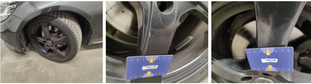
Wheel Alloy Front Left // Repair-scratch