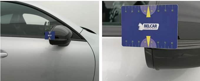
Side View Mirror Right // Plastic Repair-scratch