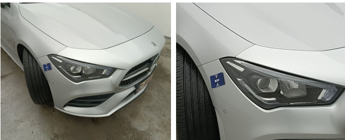
Bumper Front // Painting-bad repair