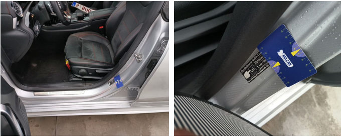
Rocker Panel Left // Smart Repair Medium-dent