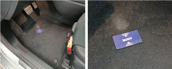
Interior / Floor Covering / Replace-worn