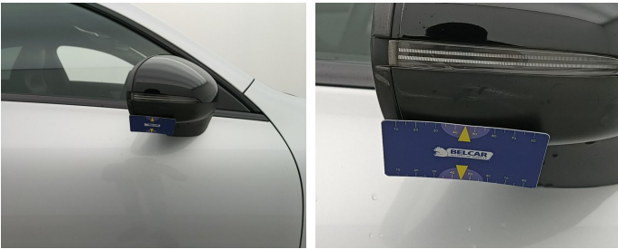
Side View Mirror Right / Shell / Replace Not Painted-scratch