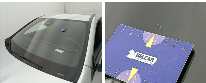
Windshield // Replace-glass damage