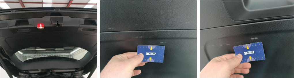
Trunk Lid Interior Coating / Complete Panel / Replace-scratch