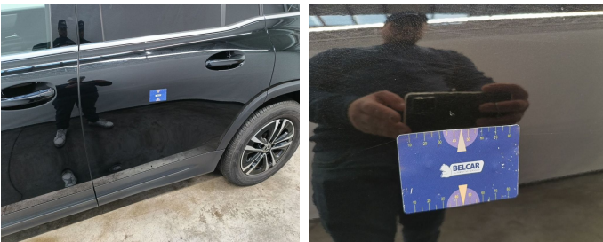
Door Rear Left // Painting-scratch