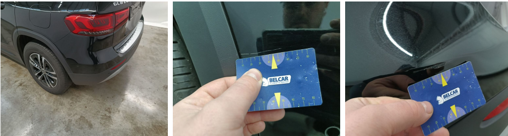
Bumper Rear // Painting-scratch