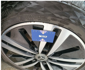
Wheel Two Tone Front Right // Repair-scratch