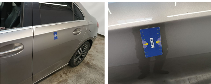
Door Rear Left // Painting-scratch