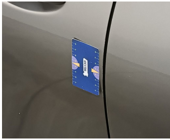
Door Front Left // Smart Repair Small-scratch