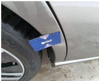
Wing Rear Right // Polish-scratch