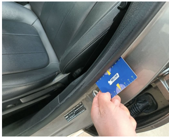
Interior // Repair 1-worn