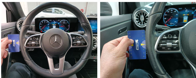
Dashboard / Steering Wheel / Replace-worn