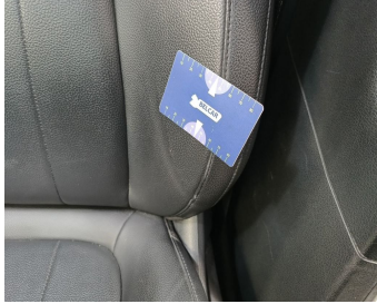
Seat Front Left / Rear Coating / Replace-worn