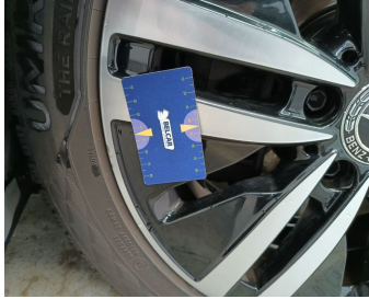
Wheel Two Tone Front Left // Repair-scratch