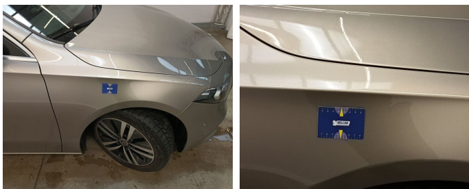
Wing Front right // Polish-bad repair