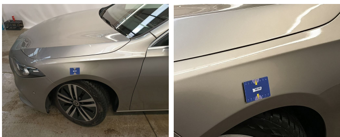
Wing Front Left // Polish-bad repair