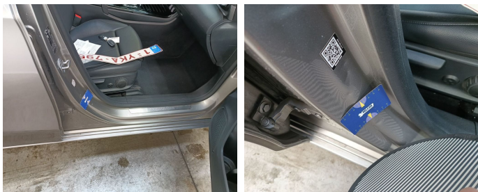
Rocker Panel Right // Smart Repair Medium-scratch + dent