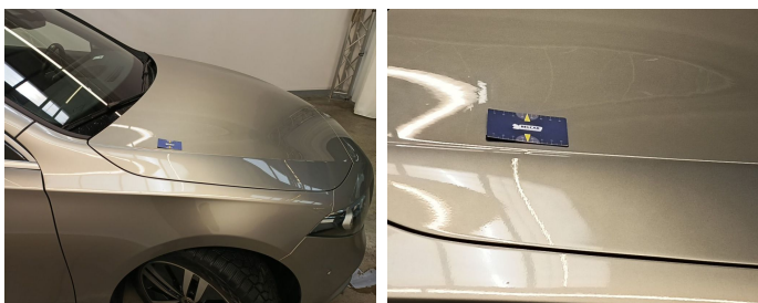
Front Bonnet // Polish-bad repair