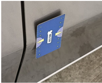
Door Front Right // Smart Repair Small-scratch