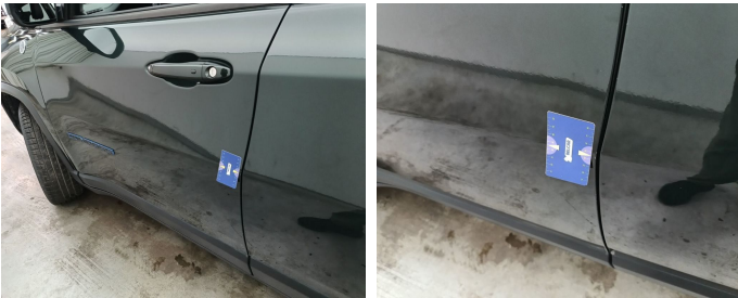
Door Front Left // Smart Repair Small-scratch