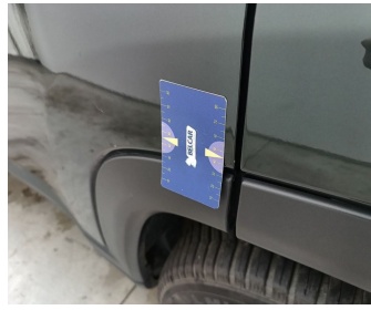
Door Rear Left // Repair & Painting-scratch + dent