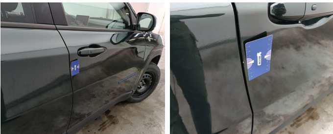
Door Front Right // Smart Repair Small-scratch