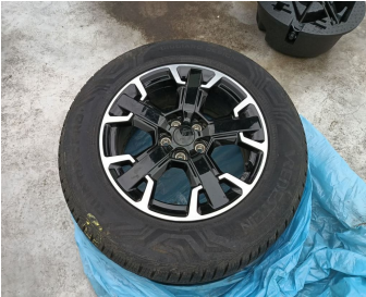
Tyre Front Right // Replace-N comf / out of order