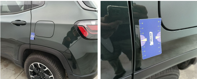
Wing Rear Left // Painting-scratch