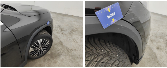
Wing Front right / Trim / Replace-scratch