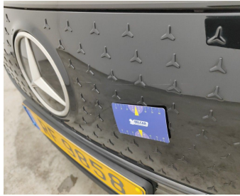
Front / Calendar / Replace-scratch