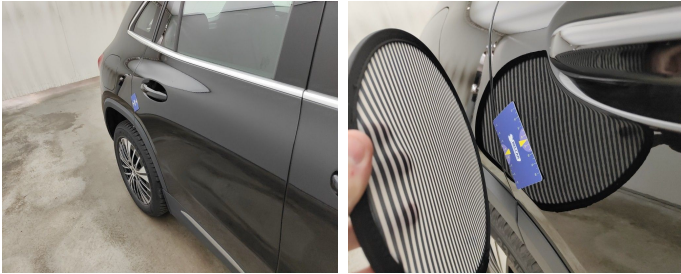
Door Rear Right // Smart Repair Medium-scratch + dent