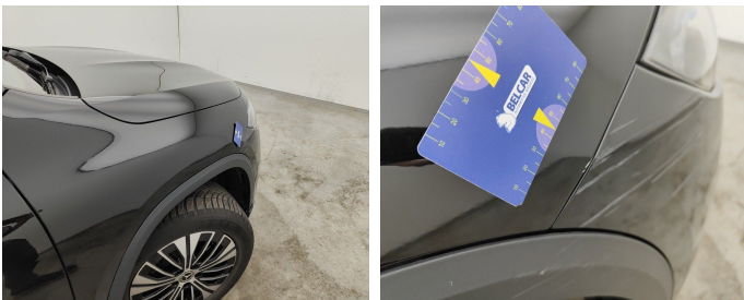
Wing Front right // Smart Repair Medium-scratch