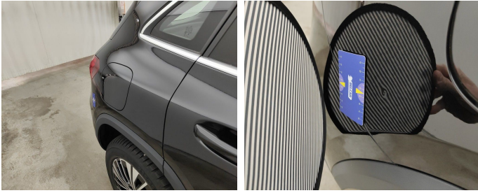
Wing Rear Right // Smart Repair Small-dent