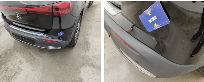
Bumper Rear // Polish-scratch