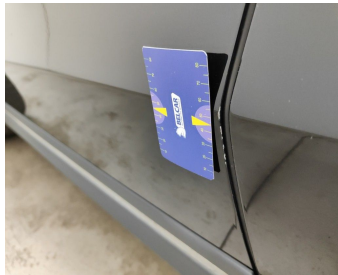
Door Front Left // Smart Repair Small-scratch