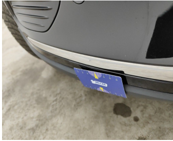
Bumper Front / Trim Right / Replace-scratch