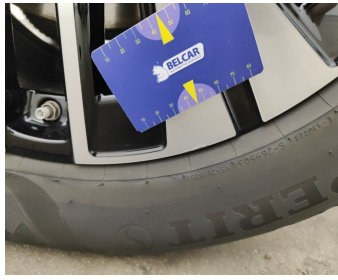
Wheel Two Tone Front Right // Repair-scratch