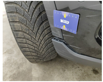
Bumper Front / Spoiler / Replace-scratch