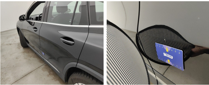
Door Rear Left // Painting-scratch + dent