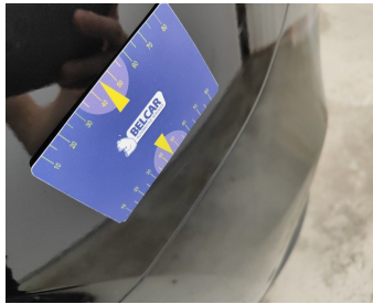
Wing Rear Left // Polish-scratch