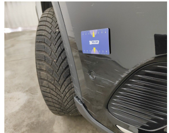
Bumper Front // Repair & Painting-scratch + dent