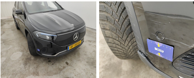
Front / Park Assist Sensor / Replace-scratch