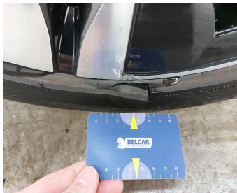
Tyre Rear Right // Replace-tear