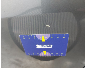
Door Rear Left // Smart Repair Medium-scratch + dent