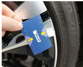
Wheel Two Tone Rear Right // Repair-scratch