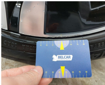
Wheel Two Tone Rear Left // Repair-scratch