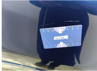
Damage within Renta-norm-