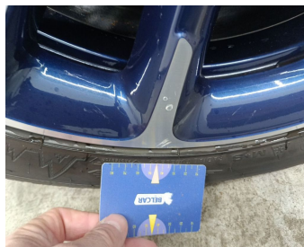
Wheel Alloy Rear Right // Replace-scratch + dent