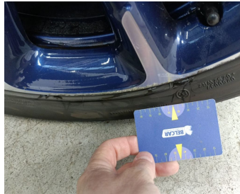
Wheel Two Tone Front Left // Repair-scratch