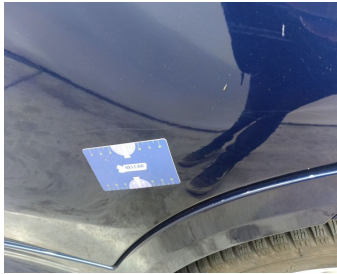
Door Rear Left // Polish-scratch