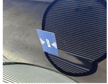
Door Rear Right // Repair & Painting-scratch + dent