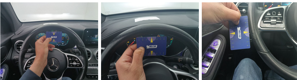
Dashboard / Steering Wheel / Replace-worn