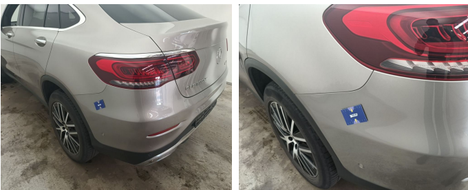
Bumper Rear // Painting-bad repair