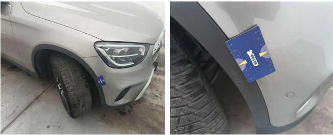
Wing Front right / Trim / Replace-scratch