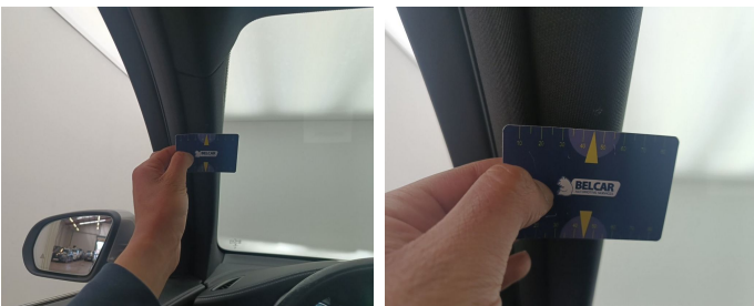
Interior / A Pillar Cover / Replace-Incinerated