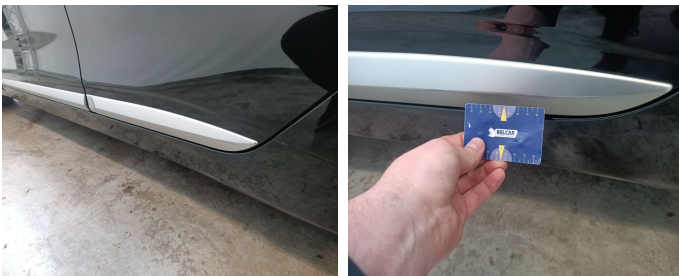
Door Rear Left / Trim / Replace-scratch