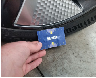
Wheel Alloy Front Right // Repair-scratch