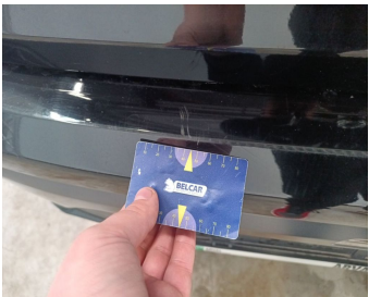
Bumper Rear // Smart Repair Large-scratch + dent