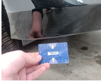
Bumper Front // Smart Repair Large-scratch