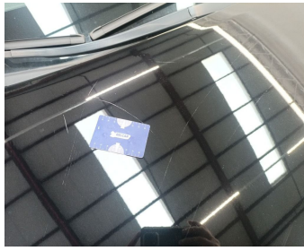
Front Bonnet // Polish-scratch