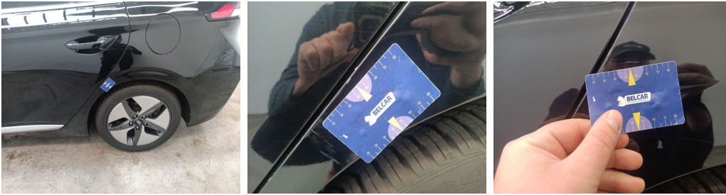
Wing Rear Left // Painting-scratch