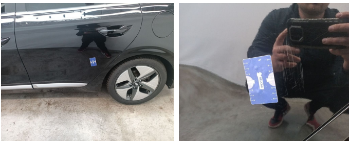
Door Rear Left // Painting-scratch