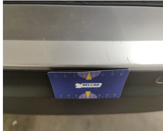
Bumper Rear / Spoiler / Replace-scratch