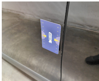
Door Front Left // Smart Repair Medium-scratch