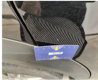
Door Rear Right // Repair & Painting-scratch + dent