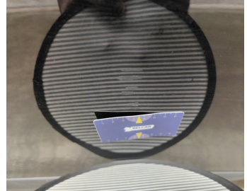
Door Rear Left // Repair & Painting-scratch + dent