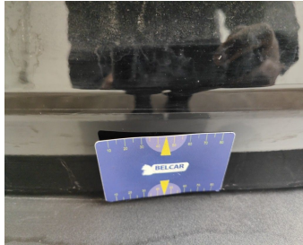
Rear Bonnet // Painting-scratch