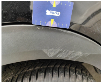
Wing Rear Right / Trim / Replace-scratch