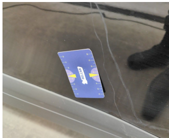
Door Front Right // Painting-scratch