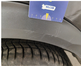
Wing Rear Left / Trim / Replace-scratch