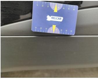
Damage within Renta-norm-scratch