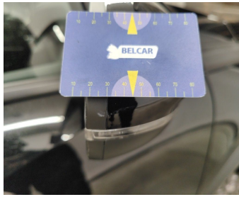
Side View Mirror Right // Replace Not Painted-scratch