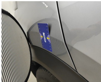
Wing Rear Right // Smart Repair Small-dent