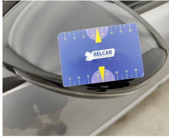
Side View Mirror Left // Painting-scratch