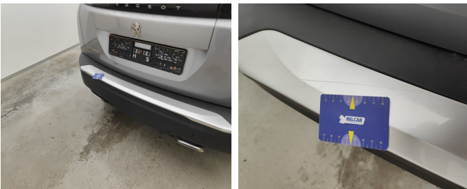
Bumper Rear / Trim Center / Replace-scratch