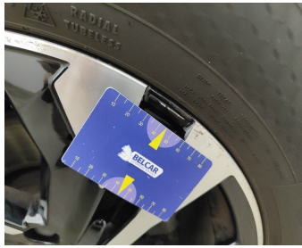
Wheel Two Tone Front Right // Repair-scratch