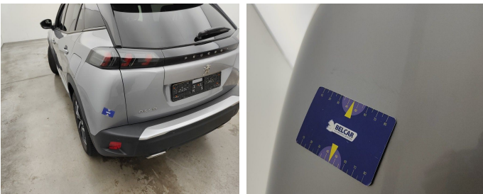
Bumper Rear // Polish-scratch