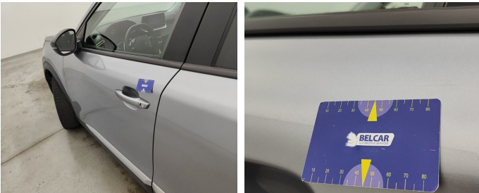
Door Front Left // Polish-scratch