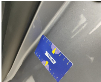
Rocker Panel Left // Painting-scratch