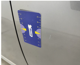
Door Rear Left // Polish-scratch