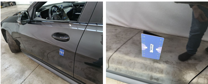
Door Front Left // Painting-scratch