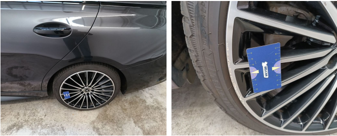
Wheel Two Tone Rear Left // Repair-scratch