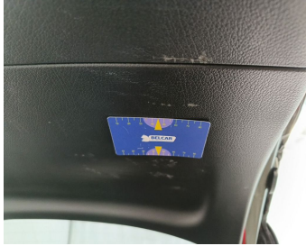
Trunk Lid Interior Coating / Complete Panel / Replace-scratch