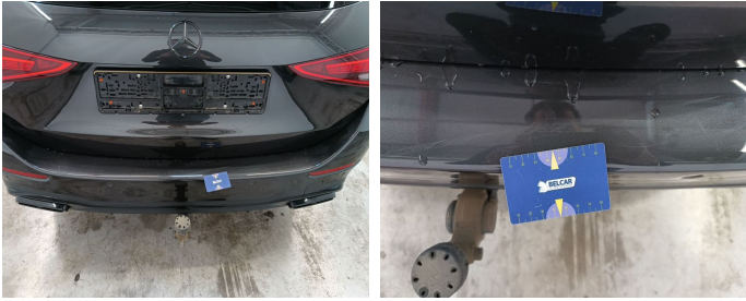
Bumper Rear // Polish-scratch