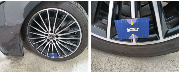
Wheel Two Tone Front Left // Repair-scratch