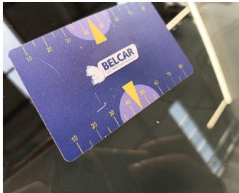
Windshield // Repair-glass damage