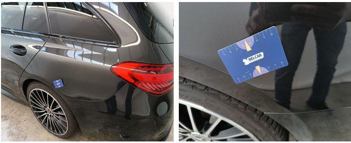
Wing Rear Left // Painting-scratch