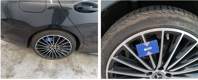
Wheel Two Tone Rear Right // Repair-scratch