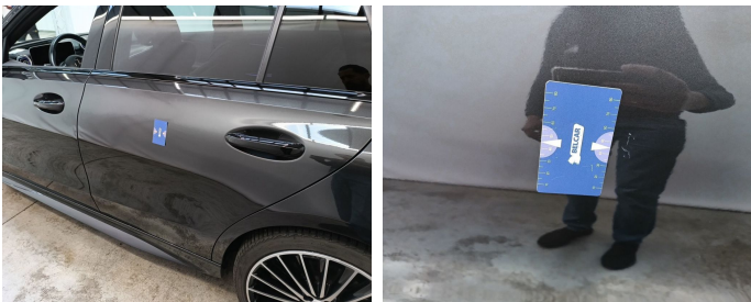
Door Rear Left // Painting-scratch