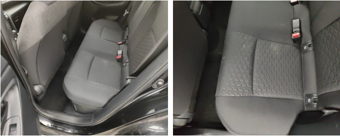
Interior Cleaning // Small-stain