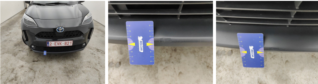
Bumper Front / Spoiler / Replace-scratch + dent