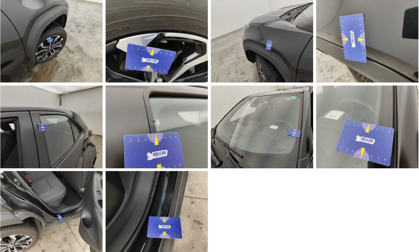
Damage within Renta-norm-