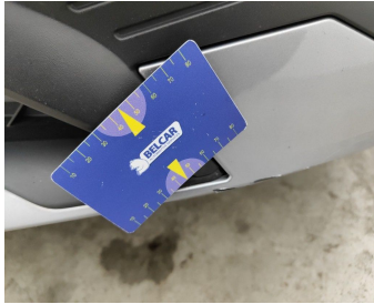
Bumper Front / Grid Central / Replace-scratch