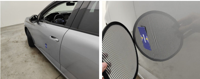
Door Front Left // Smart Repair Small-dent