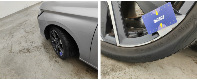
Wheel Two Tone Front Left // Repair-scratch