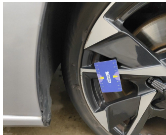
Wheel Two Tone Front Right // Repair-scratch