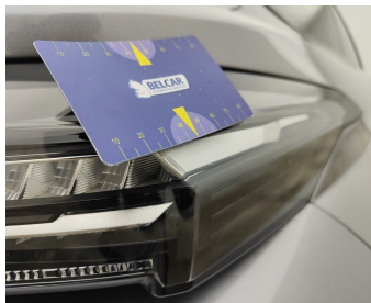
Light / Rear Right / Replace-scratch