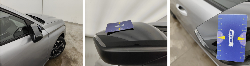
Side View Mirror Right // Polish-scratch