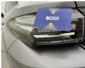
Light / Rear left / Replace-scratch