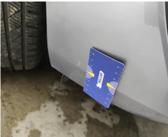
Bumper Front // Painting-scratch