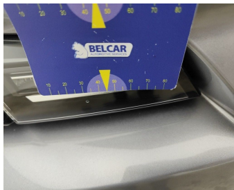
Light / Rear Left On Rear Bonnet / Replace-scratch