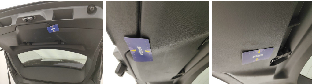
Trunk Lid Interior Coating / Complete Panel / Replace-scratch