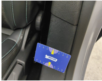
Damage within Renta-norm-scratch