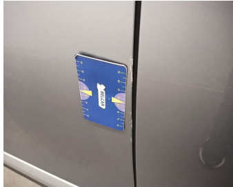
Door Front Left // Smart Repair Medium-scratch