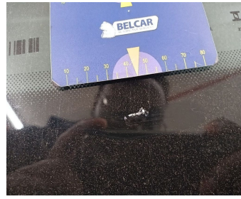
Windshield // Replace-cracked