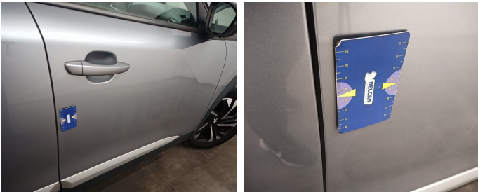
Door Front Right // Smart Repair Medium-scratch