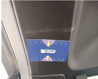
Trunk Lid Interior Coating / Complete Panel / Replace-scratch