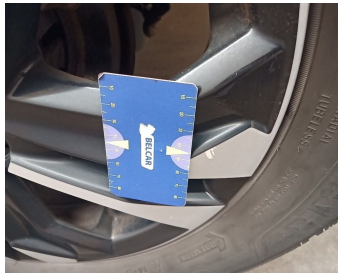
Wheel Two Tone Rear Left // Repair-scratch