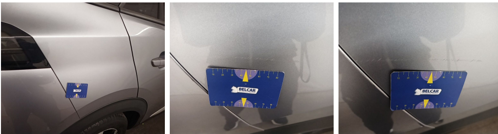
Wing Rear Right // Painting-scratch