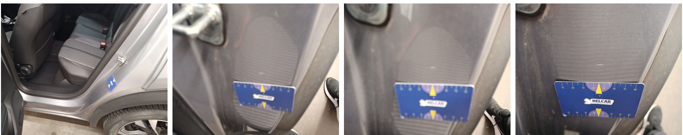
Rocker Panel Left // Smart Repair Medium-scratch + dent