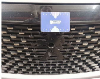
Front / Logo / Replace-missing