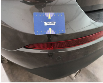
Back Side / Reflector L / Replace-cracked