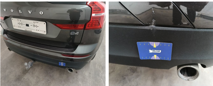
Bumper Rear / Lower Cover Not Painted / Replace-scratch + dent