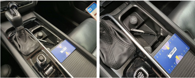
Interior // Repair 1-cracked