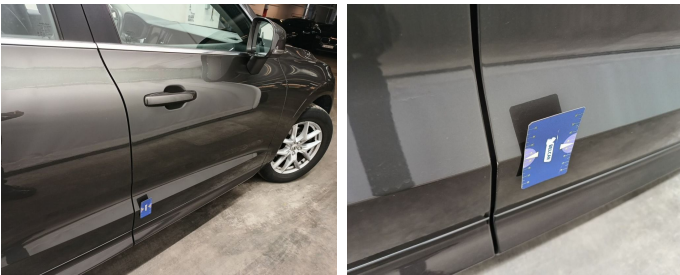
Door Front Right // Smart Repair Small-scratch