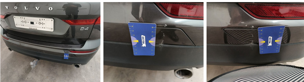
Towing Cover Rear // Replace-scratch + dent