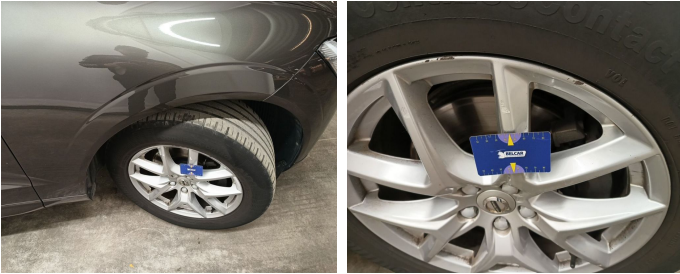
Wheel Alloy Front Right // Repair-scratch