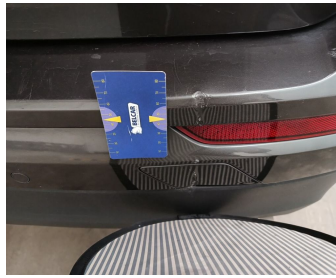
Bumper Rear // Repair & Painting-scratch + dent