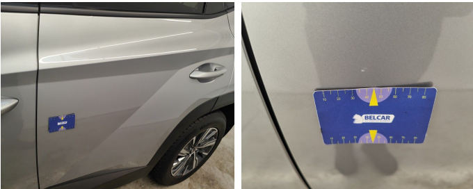
Door Rear Left // Painting-scratch