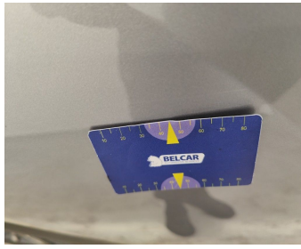
Door Rear Right // Polish-scratch