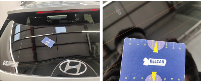
Rear Bonnet / Rear Window / Replace-scratch