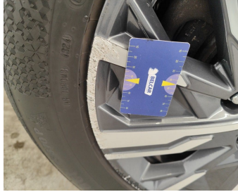
Wheel Two Tone Rear Right // Repair-scratch