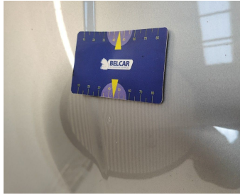
Front Bonnet // Smart Repair Small-scratch + dent