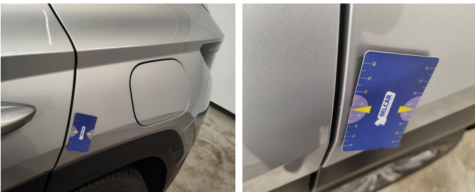
Wing Rear Left // Smart Repair Medium-scratch