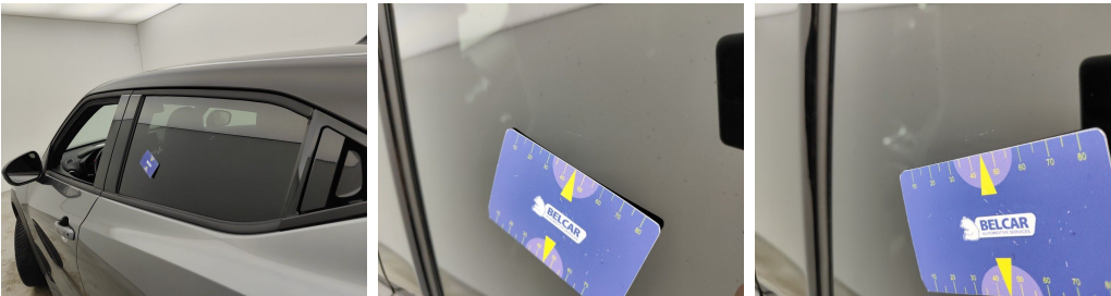
Door Rear Left / Window / Replace-scratch