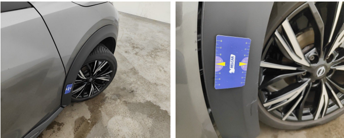
Wing Front right / Trim / Replace-scratch