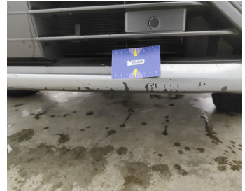
Bumper Front / Spoiler / Replace-Chipped paint