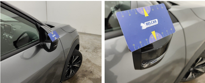
Side View Mirror Right // Painting-scratch