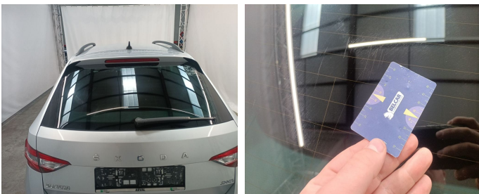
Rear Bonnet / Rear Window / Replace-scratch