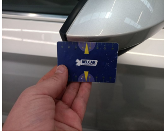
Side View Mirror Right // Painting-scratch