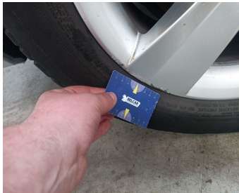
Wheel Alloy Rear Right // Repair-scratch