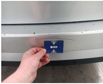
Bumper Rear // Painting-scratch