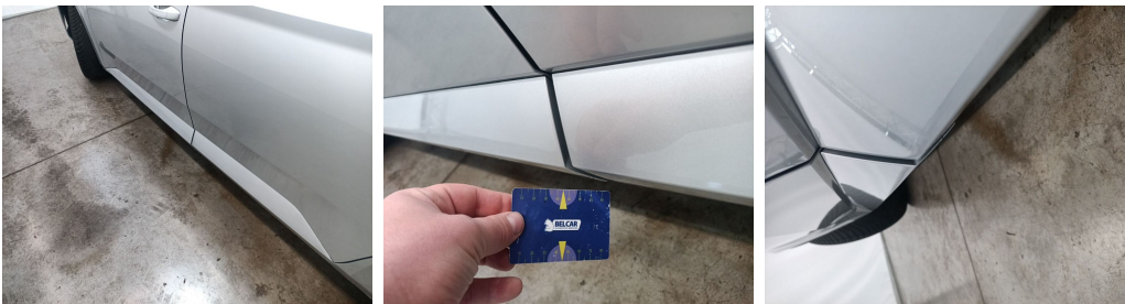
Door Front Left // Smart Repair Medium-bad position