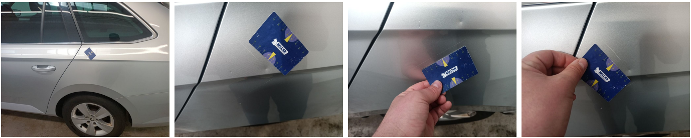
Wing Rear Left // Repair & Painting-scratch + dent