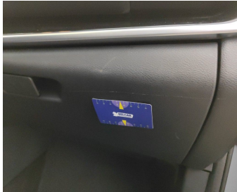
Dashboard / Storage Tray / Replace-scratch