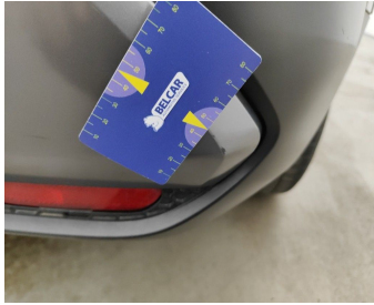
Bumper Rear / Trim Center / Replace-scratch