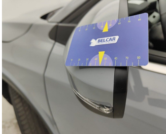
Side View Mirror Left // Painting-scratch