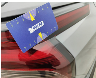
Light / Rear Right / Replace-scratch