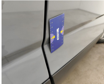
Door Front Right // Smart Repair Small-scratch