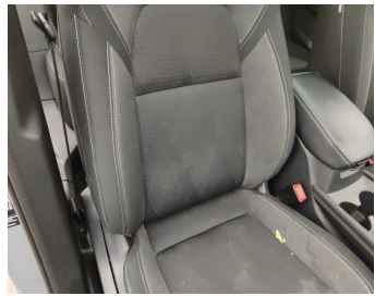
Interior Cleaning // Small-stain