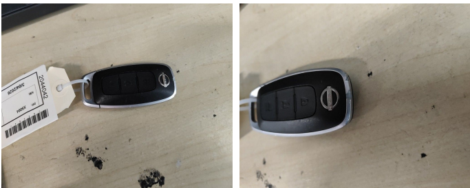
Key Price Range 2 //-worn