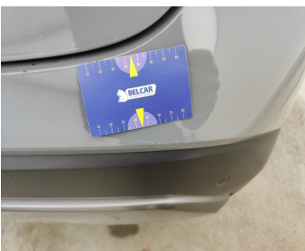
Bumper Rear // Painting-scratch