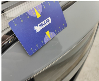
Bumper Front / Trim Left / Replace-scratch