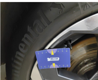
Wheel Two Tone Front Right // Repair-scratch