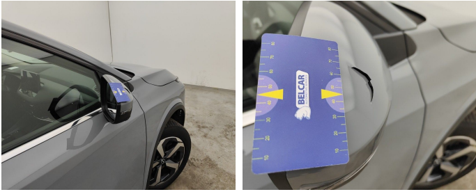
Side View Mirror Right / Shell / Replace Painted-cracked