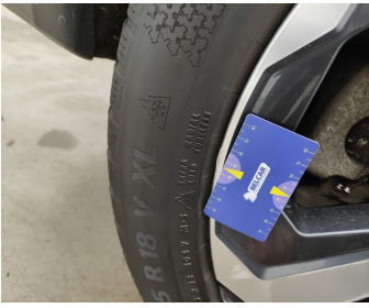
Wheel Two Tone Rear Right // Repair-scratch