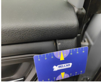
Rear Left Door Interior Coating // Replace Completely-scratch