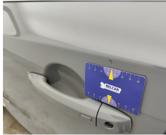
Door Front Left // Smart Repair Medium-scratch