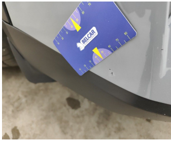
Bumper Front // Painting-stone chipping