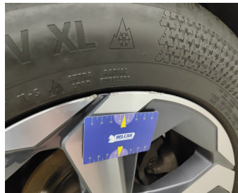
Wheel Two Tone Rear Left // Repair-scratch