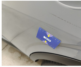
Door Rear Left // Painting-scratch