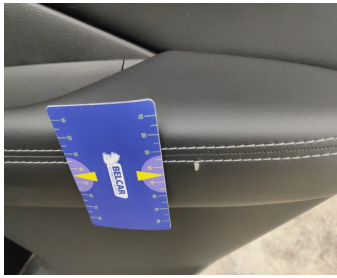
Rear Right Door Interior Coating // Repair-scratch