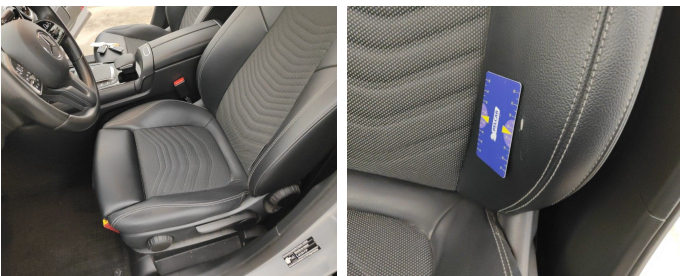
Seat Front Left / Rear Coating / Replace-tear