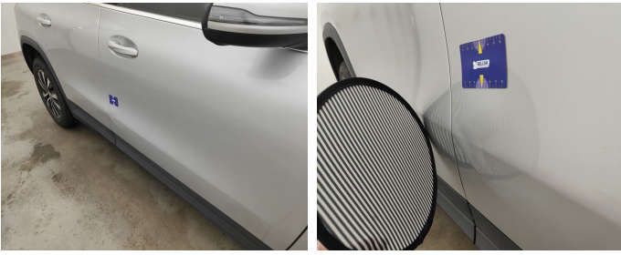
Door Front Right // Repair & Painting-scratch + dent