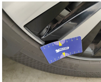
Wheel Two Tone Front Right // Repair-scratch