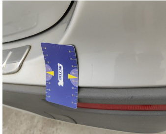
Bumper Rear // Polish-scratch