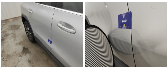
Door Rear Right // Repair & Painting-dent