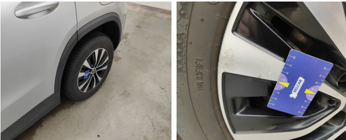
Wheel Two Tone Rear Left // Repair-Chemical reaction