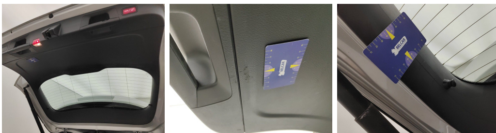
Trunk Lid Interior Coating / Complete Panel / Replace-scratch