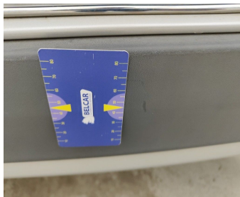
Bumper Rear / Lower Cover Not Painted / Replace-scratch