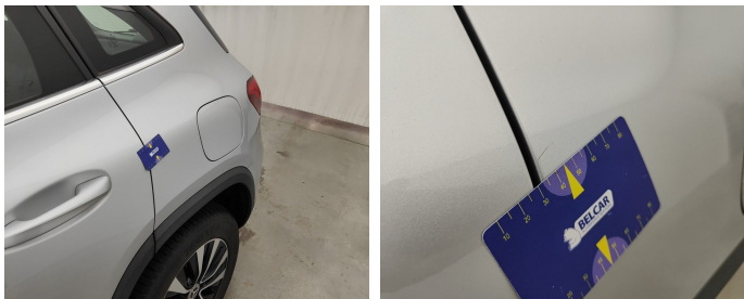
Wing Rear Left // Polish-scratch