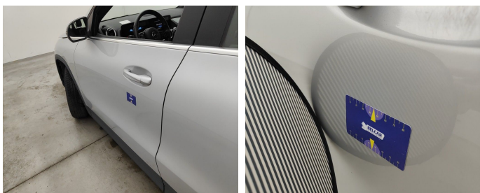
Door Front Left // Smart Repair Small-dent