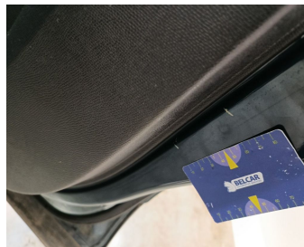
Door Rear Right // Smart Repair Medium-scratch + dent