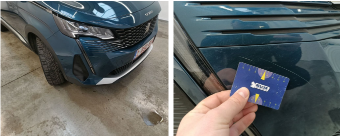
Bumper Front // Smart Repair Medium-scratch