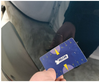
Bumper Rear // Polish-scratch