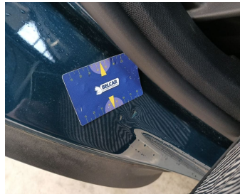
Rocker Panel Right // Smart Repair Medium-scratch + dent