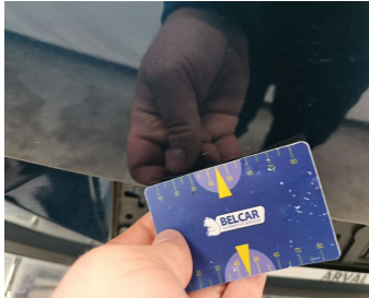
Rear Bonnet // Painting-scratch