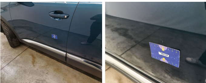
Door Front Left // Painting-scratch