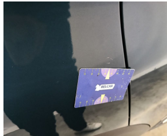
Wing Rear Right // Repair & Painting-scratch + dent