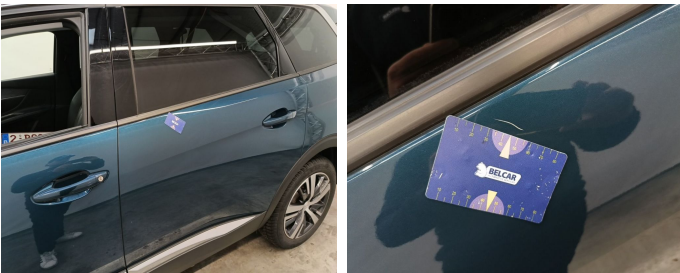
Door Rear Left // Painting-scratch