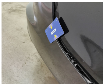
Bumper Rear // Repair & Painting-cracked