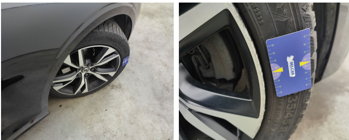
Wheel Two Tone Front Right // Repair-scratch