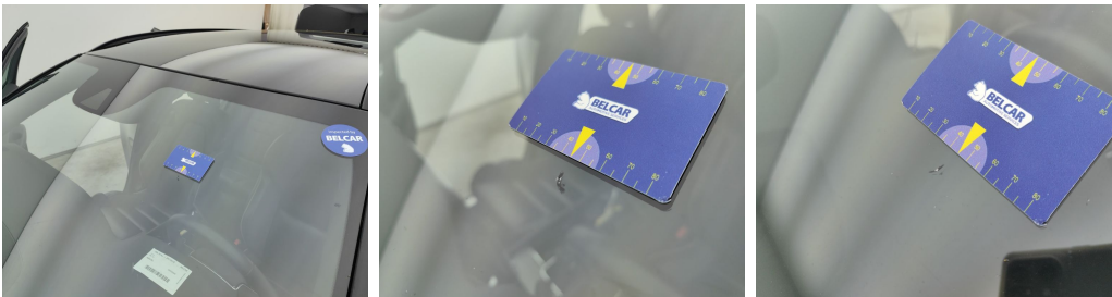
Windshield // Replace-glass damage