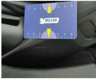
Seat Front Right // Repair-scratch