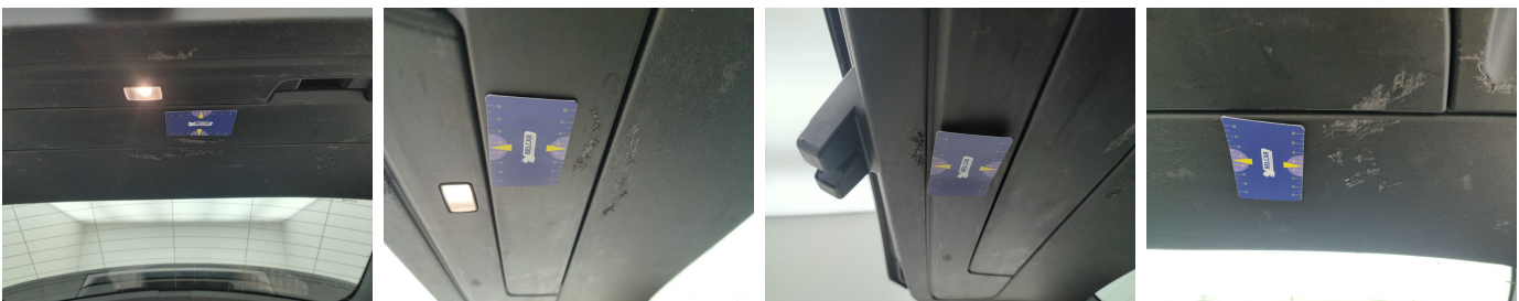
Trunk Lid Interior Coating / Complete Panel / Replace-scratch