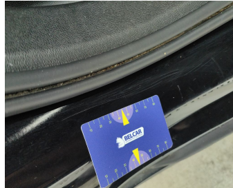
Rocker Panel Right // Polish-scratch