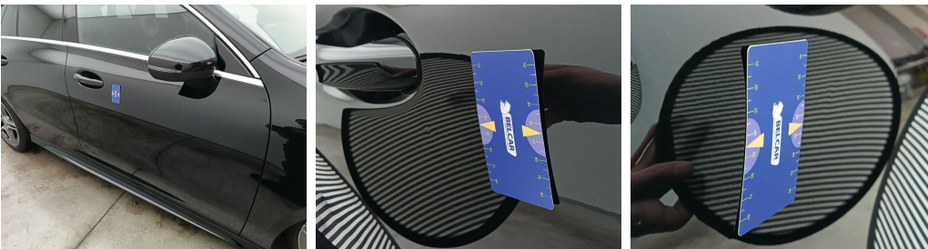
Door Front Right // Smart Repair Small-dent