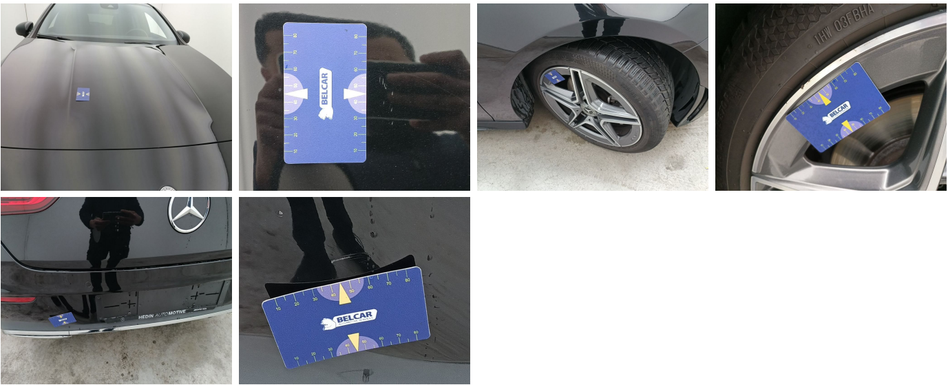
Damage within Renta-norm-scratch + dent