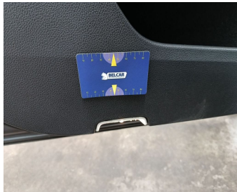
Front Left Door Interior Coating / Reflector / Replace-cracked