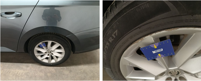
Wheel Alloy Rear Left // Repair-scratch