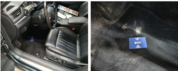
Interior // Repair 1-hole