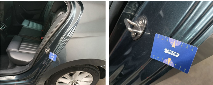
Rocker Panel Left // Smart Repair Medium-scratch