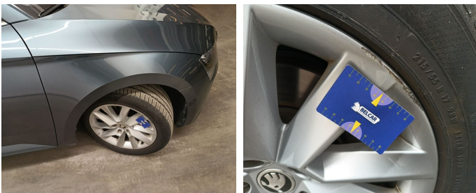
Wheel Alloy Front Right // Repair-scratch