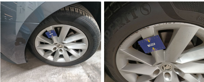
Wheel Alloy Front Left // Repair-scratch