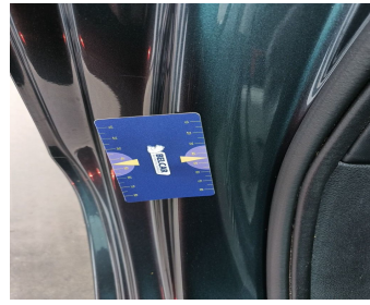
Rocker Panel Right // Smart Repair Medium-scratch