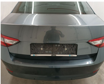
Back Side / Logo / Replace-missing