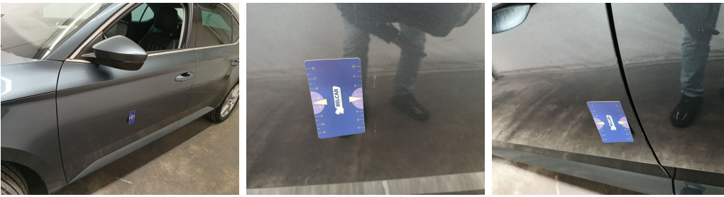
Door Front Left // Painting-scratch