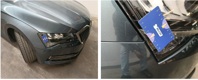
Light / Front Right / Replace-Chemical reaction