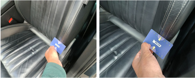
Seat Front Left / Rear Coating / Replace-worn