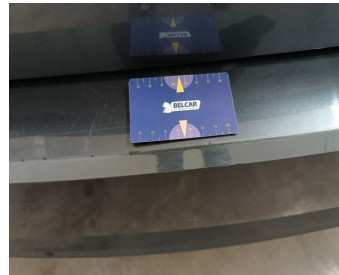
Bumper Rear // Repair & Painting-scratch + dent