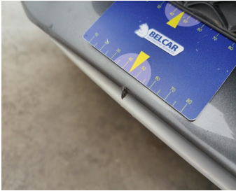
Bumper Front // Painting-scratch + dent