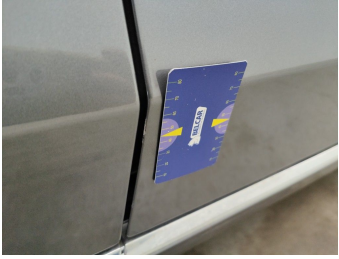
Damage within Renta-norm-