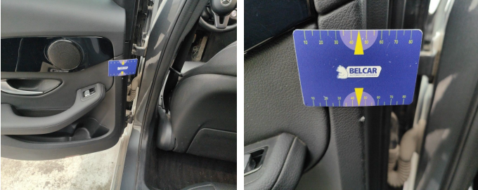
Rear Left Door Interior Coating // Repair-scratch