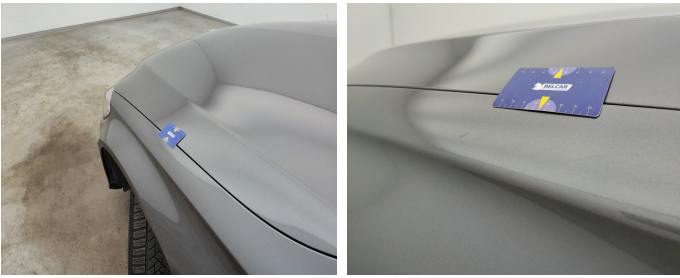
Wing Front Left // Polish-scratch