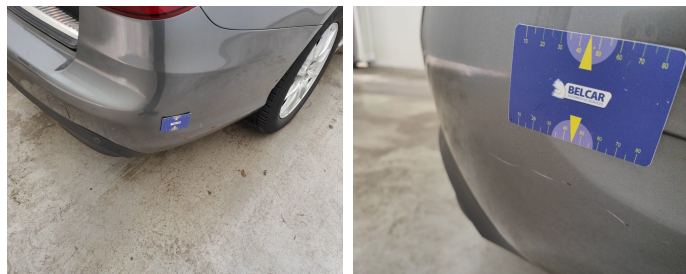
Bumper Rear // Painting-scratch