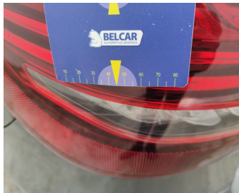
Light / Rear left / Replace-scratch