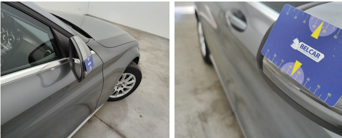
Side View Mirror Right / Direction Indicator / Replace-scratch