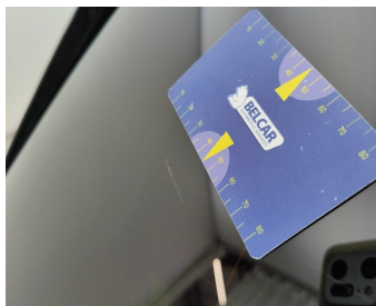
Rear Bonnet / Rear Window / Replace-scratch