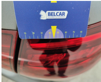
Light / Rear Right / Replace-scratch