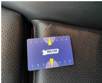
Seat Front Left / Bottom Coating / Replace-tear