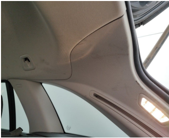
Interior Cleaning // Small-stain