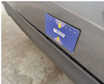
Bumper Rear // Smart Repair Small-bad position